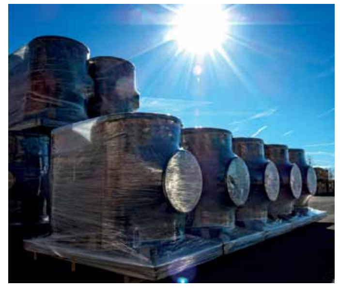
Large bore special tees and barred tees for oil&gas application