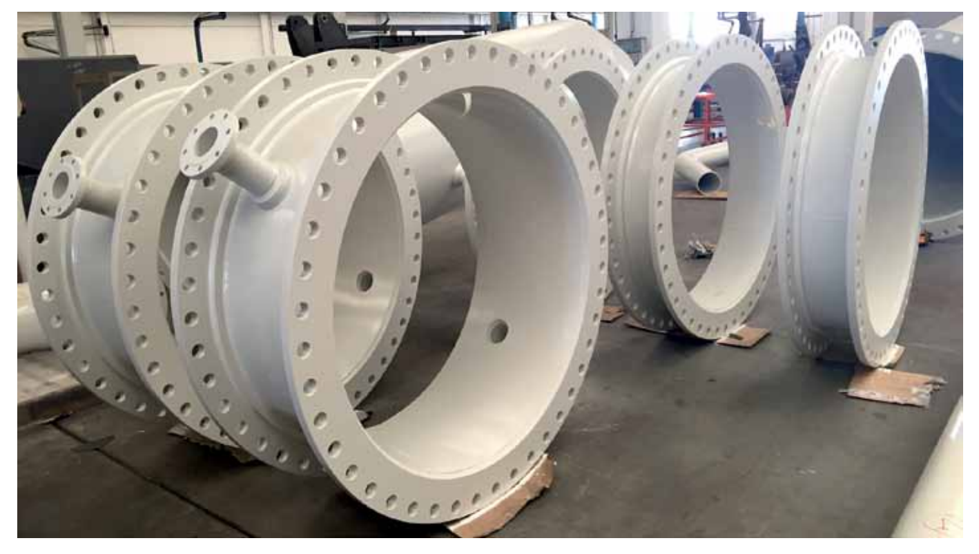
Complex systems prefabrication for oil, gas and power industry