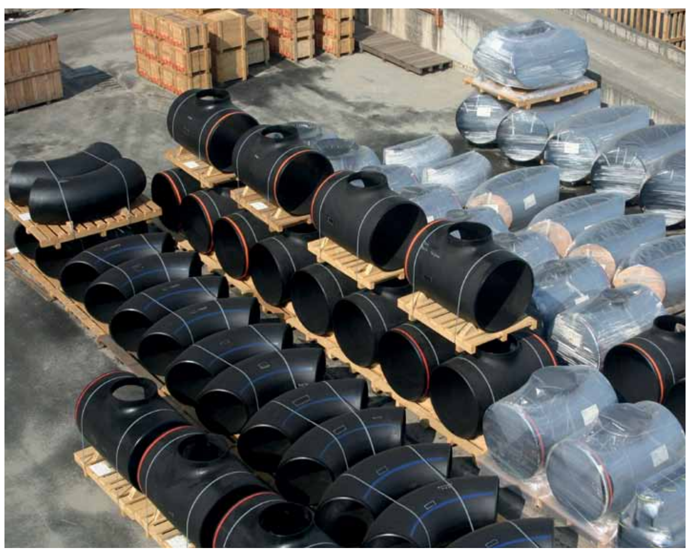
Large bore stock elbows and tees for oil&gas industry

Then in subsequent years, Allied International Southern Africa enlarged its focus and distribution network from the South-African market to the other Sub-Saharan most "energy" prominent regions within Africa, in order to develop a wide, deep and lasting presence in the continent.