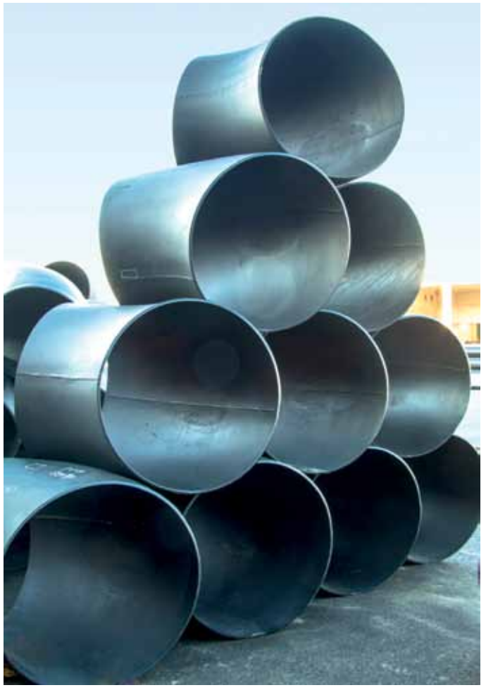
Seamless pipes, heavy wall elbows and large diameter elbows for the power industry