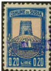
1942. COMUNE di Sussa. Values in Lire. Perf 10.