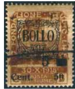
122. Above issue, further surcharged, with square block over previous value (sometimes misplaced, as in the illustration).