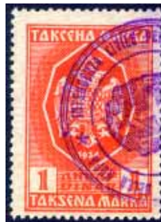
A or B

Kupa-Fiume was the hinterland to the north of Fiume. When the city of Fiume became Italian, this area had been given to Yugoslavia. In 1941 Italian troops occupied Kupa, and stocks of captured Yugoslav revenues were overprinted for the new régime. With the capitulation of Italy in 1943, German troops took effective control but did not change the revenue stamps.