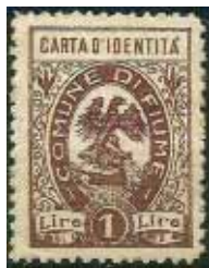
1924. Municipal Issues. Inscribed CARTA D'IDENTITA. Perf 10 (A), 11 1/2 (B).