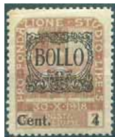
122. Postage stamps surcharged BOLLO in ornamental frame and new value.