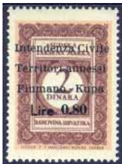
1941. Croatia issue with currency in para and Dinar, surcharged. Vale in A) sans-serif, or B) serified. Perf 11½.