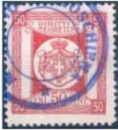
c1930. Italian Arms. 1. 50c red ..... 20.00