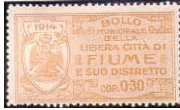
1914. Issue for the free City, text in Italian.