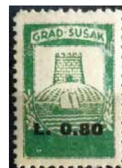
1944. Grad Susak. Values in Lire in black. Perf 11½.