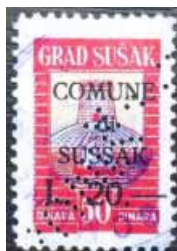
1941. Previous issue (Yugoslav currency) with black overprint: COMUNE di SUSSAK, and Italian currency surcharges.

Susak is the island to the south of Fiume. (Numbers 1/6 used for issues of 1931 under Yugoslav government, see our "Yugoslavia Revenues")