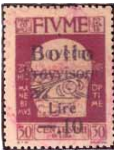
121. Provisional Government First Constituent Assembly. Postage stamps with Provisional Govt ovpt, surcharged Bollo and new value, some surcharged further.