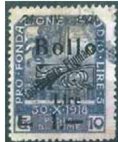
121. Postage stamps with Constituent Assembly ovpt, ovpt Bollo and new value.