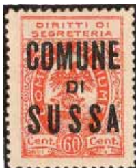
1942. Stamps of the COMUNE di Fiume/ Diritti di Segreteria, with black overprint: COMUNE DI SUSSA. A) perf 10, B) perf 11½.