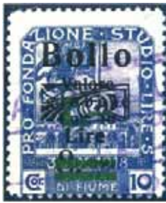
120. Same but surcharged in green (G): Globale issue with thick letters except on #124.