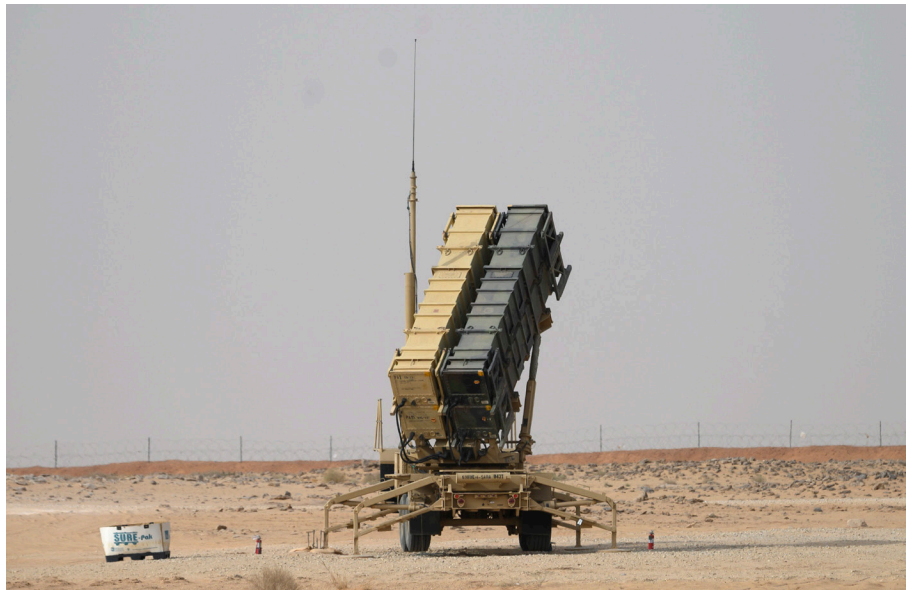
A Patriot missile battery is seen near Prince Sultan air base at al-Kharj, Saudi Arabia, on February 20, 2020.

Other Middle East countries have likewise been avid users of U.S. missile defense. These include the United Arab Emirates (UAE), Oman, Kuwait, Qatar, and soon Bahrain. Just as Saudi Arabia's investments have supported U.S. missile defense developments, the UAE's Patriot purchase in 2008 provided additional funds for Patriot modernization efforts and helped the U.S. Army buy 100 more PAC-3 missiles. 10 The UAE was also the first foreign purchaser of THAAD, buying the system in 2011 and deploying it in 2016. 11