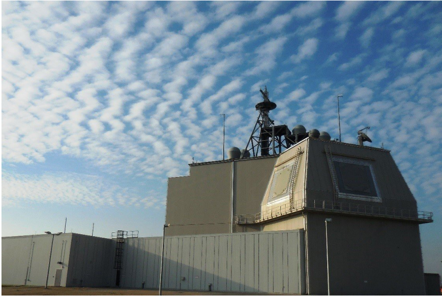
The Aegis Ashore site in Deveselu, Romania.