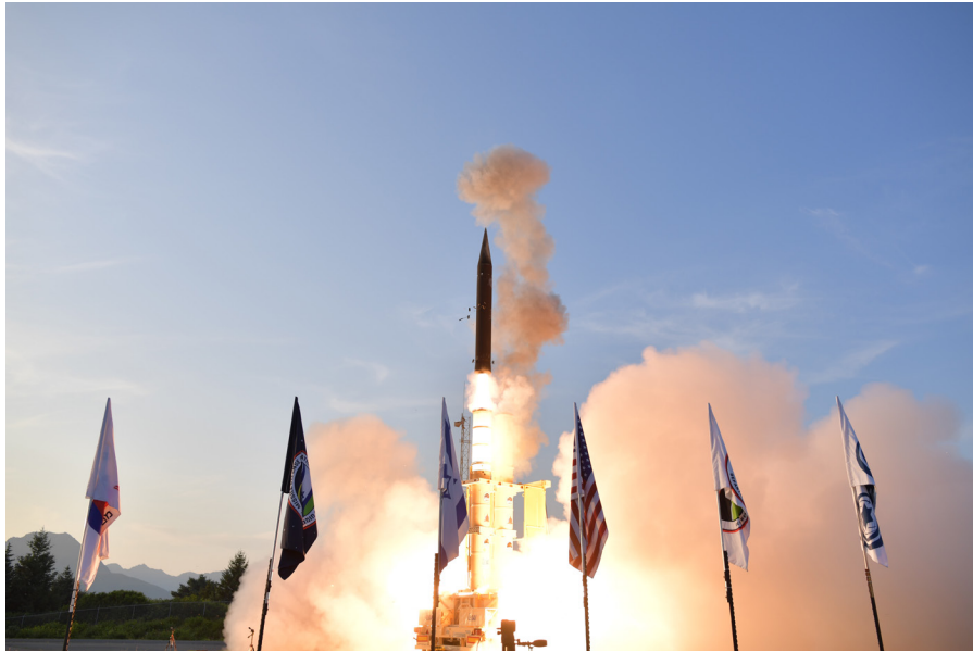
The Israel Missile Defense Organization (IMDO) and the U.S. Missile Defense Agency (MDA) complete a successful test flight of the Arrow-3 interceptor on July 28, 2019.

allies have expressed interest in the SkyCeptor as a lower-cost supplement their interceptor magazines. As previously mentioned, Poland is considering the SkyCeptor to satisfy its Narew short-range and air defense requirements. 23