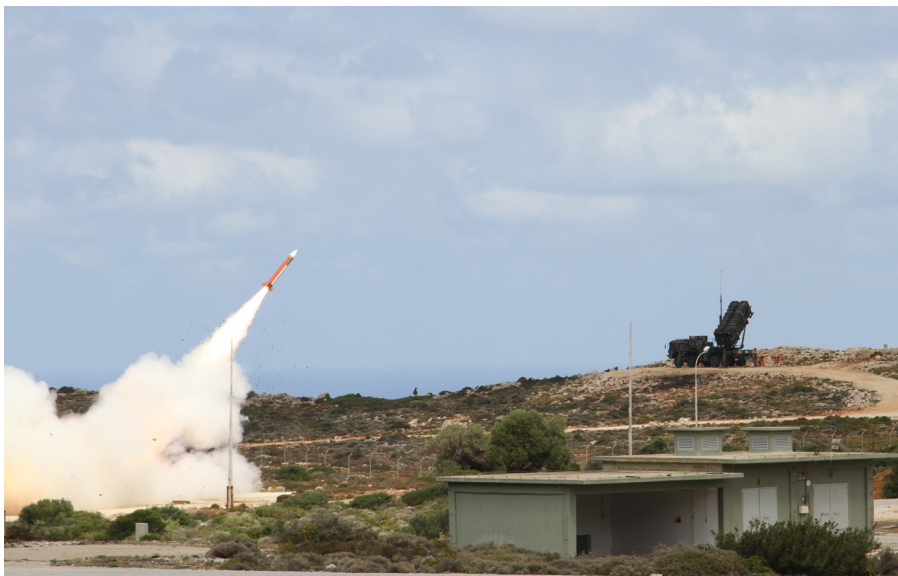
A Patriot missile launches to intercept a target during Rapid Arrow 2015.

Rapid Arrow is another NATO missile defense exercise. The 2011 iteration featured the first live-fire test using NATO’s BMD system. 51 A U.S. Aegis destroyer detected and tracked the target missile and passed that information to a German Patriot missile battery, which was stationed at the NATO Missile Firing Installation in Crete. The Patriot interceptor successfully launched and engaged the target missile. 52 Past Rapid Arrow exercise participants have included the United States, Germany, Greece, Turkey, and the Netherlands.