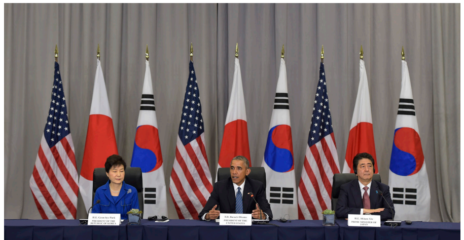
U.S. President Barack Obama takes part in a trilateral meeting with Japan’s Prime Minister Shinzo Abe and South Korea’s President Park Geun-Hye on the sidelines of the 2016 Nuclear Security Summit in Washington, DC.

Another important example of information sharing is in the Asia-Pacific. In 2014, South Korea, Japan, and the United States established the 2014 Trilateral Information Sharing Agreement (TISA) to share information about North Korea’s nuclear and missile threats. 46 Japan and South Korea also established their own bilateral agreement, the 2016 General Security of Military Information Agreement (GSOMIA). These intelligence-sharing agreements help ensure close and effective monitoring of North Korea’s missile program. Despite rocky relations between South Korea and Japan that have endangered such programs, they remain intact today.