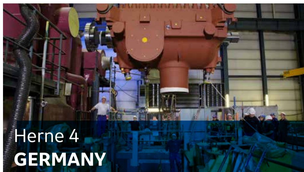
Herne 4 GERMANY

In addition to reducing emissions and extending the working life of the units, efficiency in each case improved by about 1%.