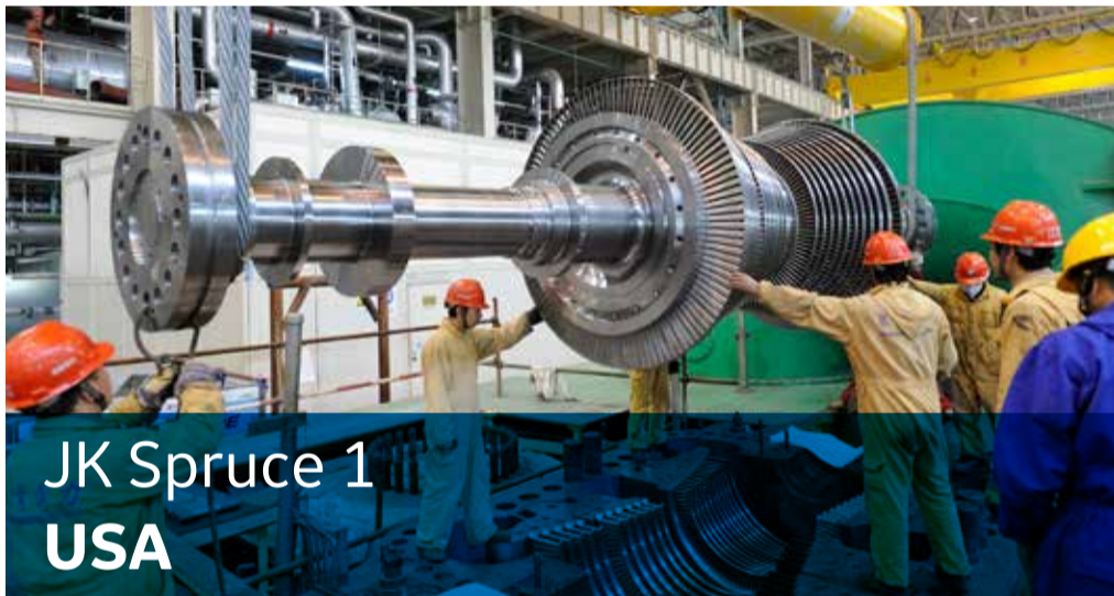
JK Spruce 1 USA