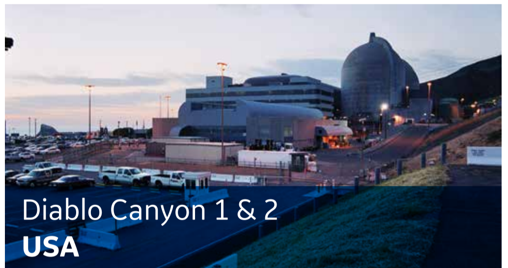
Diablo Canyon 1 & 2 USA

The plant owners wanted to extend plant life, increase performance, and reduce costs and maintenance requirements. Originally commissioned in the late 1960s, the units were retrofitted with new HP inner modules, composed of a new inner casing with integral portioned inlet nozzle belt, new rotor with eight stages of advanced rotating blades, and a new set of fixed blade diaphragms. A turbine controller also was supplied. The owner's objectives were achieved, with successful installations in 2004 and 2007 respectively.