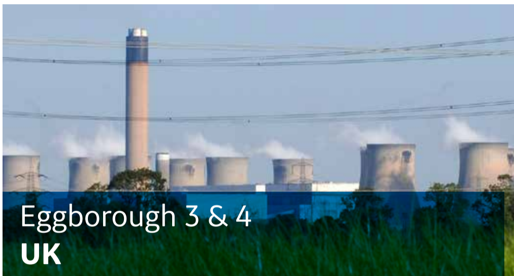
Eggborough 3 & 4 UK

GE has retrofitted more than 1,000 steam turbine cylinders worldwide. Around 40% of those were manufactured by others. In fact, GE has supplied retrofit cylinders for turbines from all major manufacturers, ranging from single-cylinder fossil-fired units of less than 20 MW to half-speed nuclear machines with outputs in excess of 1,000 MW.