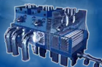
Balance of Plant