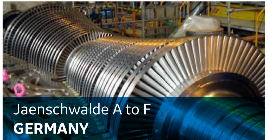
Jaenschwalde A to F GERMANY

The aim of this retrofit of a unit originally commissioned in 1992 was to enable the owners to generate electricity more economically over the remaining life of the plant. The retrofit project consisted of a new combined HP and IP module replacement using GE's advanced impulse technology blades with technical support and provision during the installation. The new rotor had three more stages in the HP section to help provide the additional power required. The retrofit cylinder was commissioned in 2002, and all performance guarantees were met. Further benchmark tests demonstrated that the performance improvements have continued, with degradation measured at a rate lower than ASME guidelines for this type of machine.