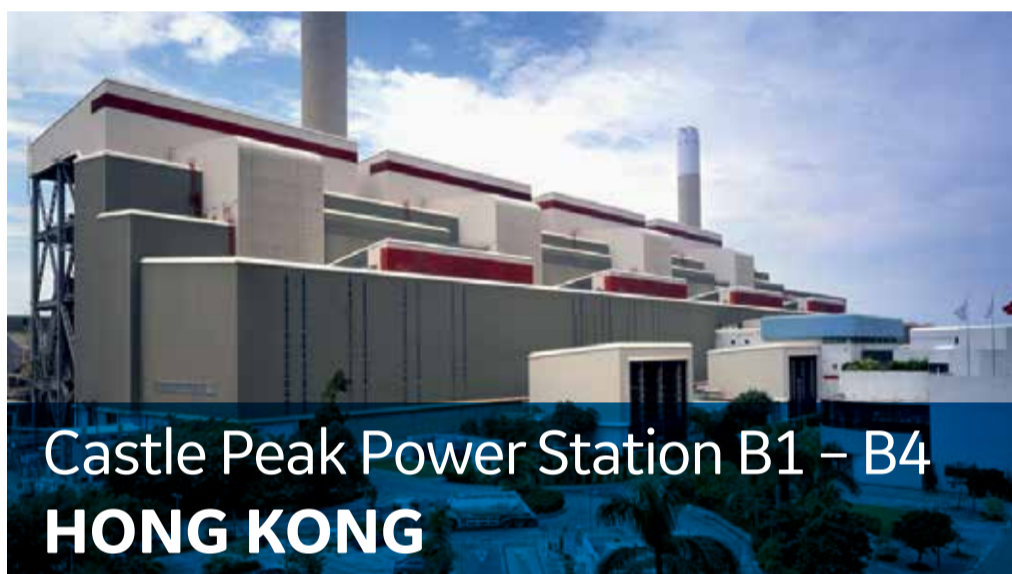
Castle Peak Power Station B1 – B4 HONG KONG