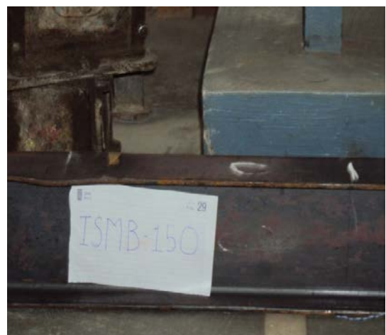
Fig.2: Local Failure- Failure of Compression Flange ISMB 150