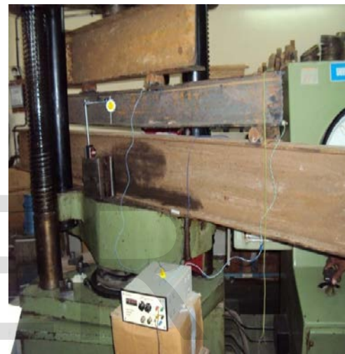
Fig.1: Testing Arrangement For Solid Web Beam ISMB 150

The following figures show that flexural behavior of Rolled steel I-Beams