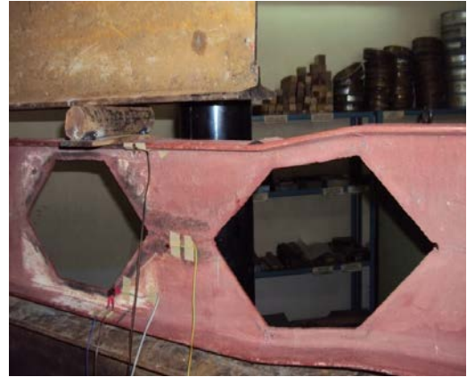
Fig.6: Flexural Buckling of Beam NCB 150