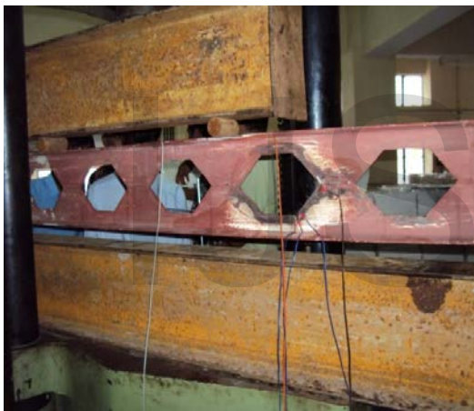
Fig.4: Beam NCB 150 Mounted for Testing