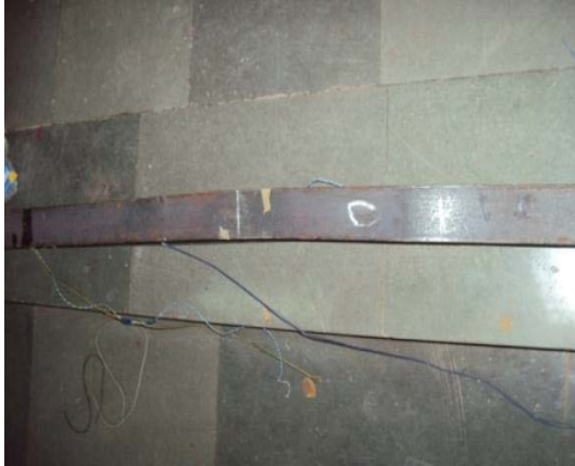
Fig.3: Lateral Torsional Buckling of ISMB 150