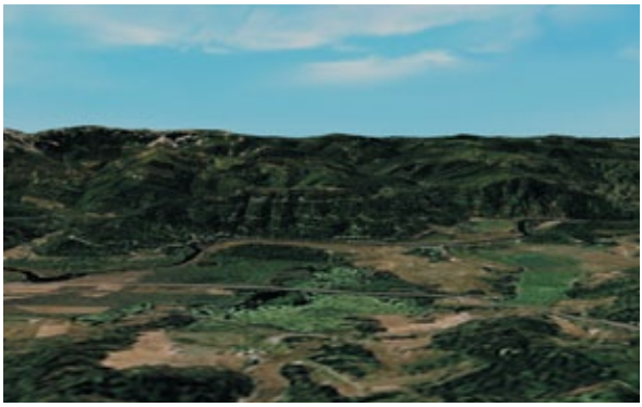
Geocentric databases support worldwide flight with no discontinuity, distortion.