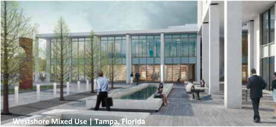
Westshore Mixed Use | Tampa, Florida