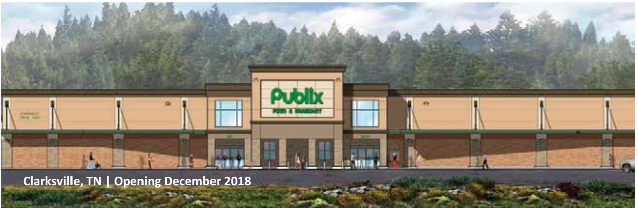
Clarksville, TN | Opening December 2018

You're only as good as the counsel you keep.