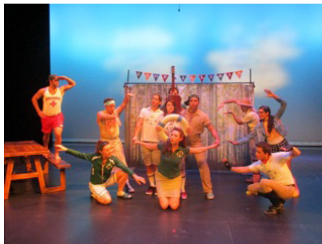
Asolo Repertory Theatre's production of Twelfth Night presented at FTC's 2015 Opening Ceremony