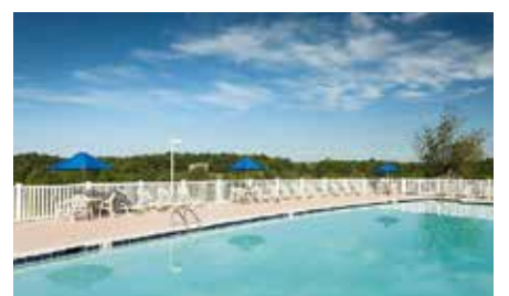
Augusta Rd, Gordonsville $14,800