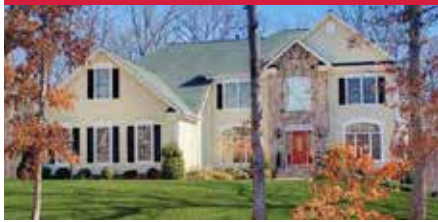
304 Pine Crest Dr, Troy $825,000