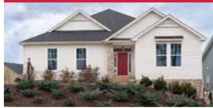
10 Cherrywood Ct, Zion Crossroads $594,500