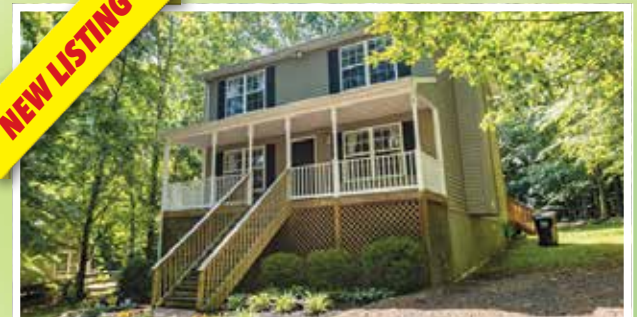
1 Landing Court $269,900

Well maintained home located at Lake Monticello. 4 bedrooms, 3.5 baths, Hardwood floors entire first level, family room with fireplace, kitchen has breakfast bar & stainless appliances. Formal dining room, vaulted master suite with attached bath & walk in closet. Partially finished walk out basement with storage area. Covered front porch, back deck & storage shed with level back yard.