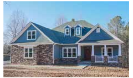
36 Bybee Estates Lane, Palmyra $595,000