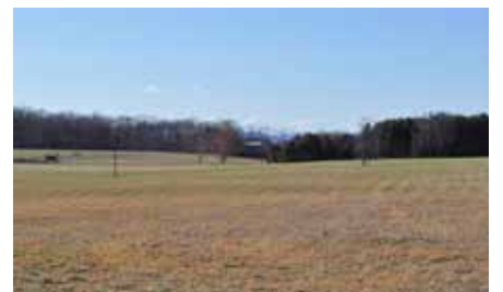
16 Hollands Road, Palmyra $75,000