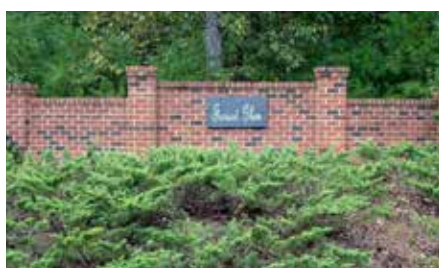
Lot 21 Forest Glen, Palmyra $79,500