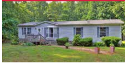
2633 Emerys Lane, Esmont $179,900