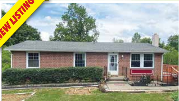
6685 Jefferson Mill Road $189,900

Located in Albemarle County just 25 minutes to Charlottesville, is this brick rancher on 2 acres. 4 bedrooms, 1.5 baths, hardwood & laminate flooring, large eat in kitchen. Deck & mature landscaping with many fruit trees. HVAC new 2019, detached garage with a one bedroom apartment with separate meter & septic.