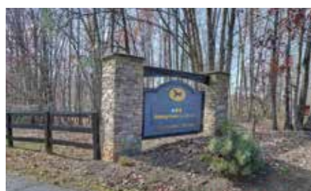
336 Country Club Ln, Gordonsville $18,000