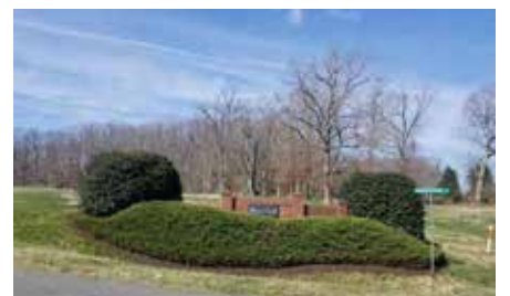
Lot 4 Meadow Brook Ln, Palmyra $60,000