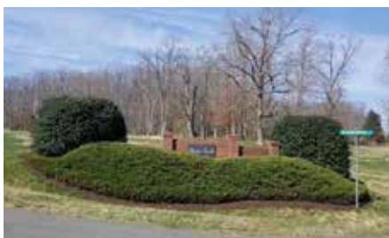
13 Pine Shadow Ct, Palmyra $75,000