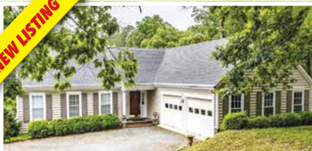
15 Bonita Road $589,000

Bring your boat! Immaculate waterfront home 105' water frontage, 3 bedrooms, 3 full baths, first floor owner's suite & laundry. Gleaming hardwood floors, eat in kitchen with breakfast bar, pantry, breakfast nook. Formal dining room, family room with skylights, gas fireplace & vaulted ceilings. Gentle walk to the boat dock and water. Landscaped lot with walkways, 2 car garage, new roof, newer HVAC system, new gas hot water heater, 2 viewing decks. Great views to the main lake.