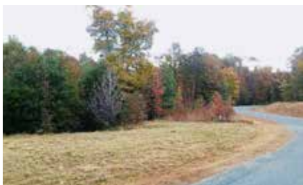
Bybee Estates Ln, Palmyra $89,000