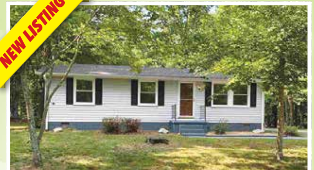
45 Hardware Hills Circle $204,500

Country living at its best! Lovingly cared for 3 bedroom, 1 bath home situated on a level lot located close to Scottsville. Totally MOVE IN ready. Huge eat in kitchen leads to the deck & large backyard. New insulated windows, carpet & freshly painted. Newer Air handler & HVAC system, Well pump replaced 4 years ago. 1 acre lot on the Fluvanna/Albemarle line.