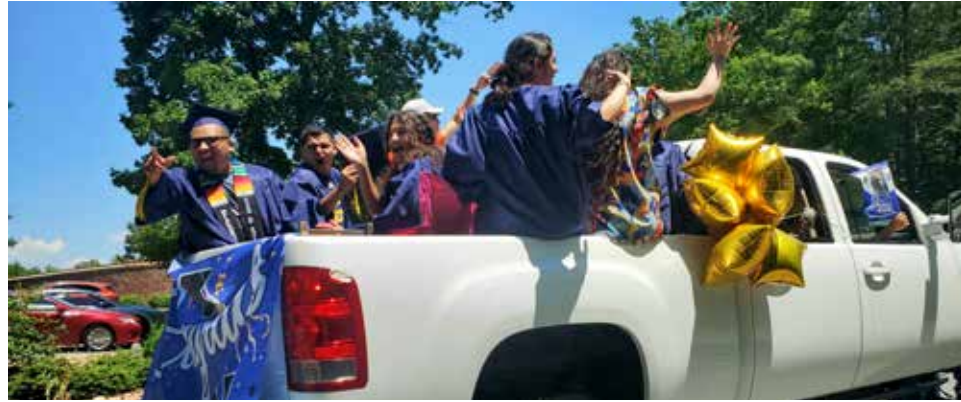
Fluco victory parade.

More than 65 graduating Flucos took a victory lap around Lake Monticello June 5 in a parade coordinated by the Lake Monticello Community Foundation.