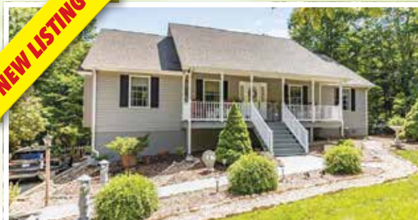
2 Landing Court $339,900

Well designed, quality built home awaiting new owners. 3 bedrooms, 3 full baths, generous sized rooms, large formal dining room, hardwood & ceramic flooring, vaulted ceilings. Master suite with luxurious attached bath, first level laundry. Finished lower level features an In Law suite with Rec Room, full bath, kitchen & laundry. 2 car attached garage, beautiful landscaping, deck & country front porch.