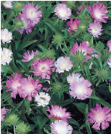
Color Wheel Stokesia