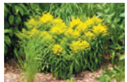
Little Lemon Solidago