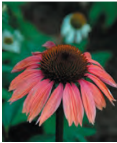
Summer Sky Echinacea