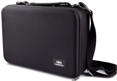
BAG with SHOULDER STRAP