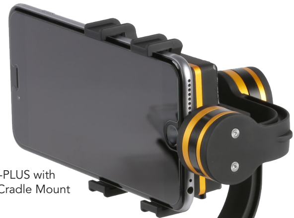
FLY-X3-PLUS with Large Cradle Mount

3. You may install the GoPro or small phone mount by inserting into slots and sliding into position and replacing the hex screws.