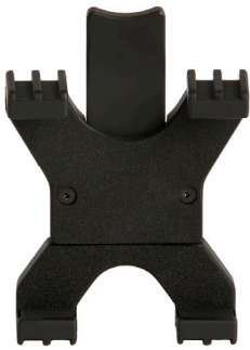
LARGE CRADLE MOUNT