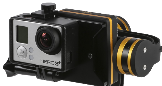
FLY-X3-PLUS with GoPro Mount