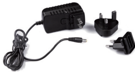
CHARGER & PLUGS