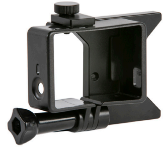
GoPro CRADLE MOUNT