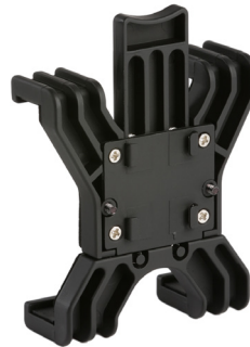
SMALL CRADLE MOUNT