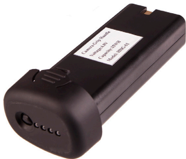
FX3P-BATT FLY-X3 PLUS Battery