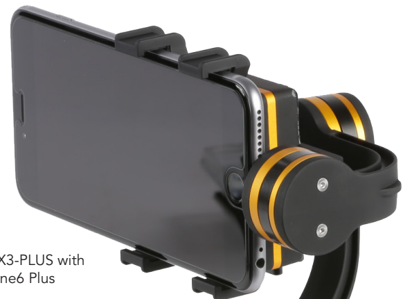
FLY-X3-PLUS with iPhone6 Plus