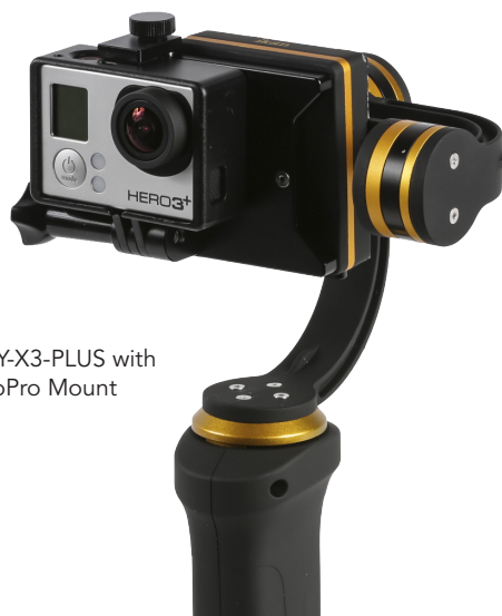
FLY-X3-PLUS with GoPro Mount