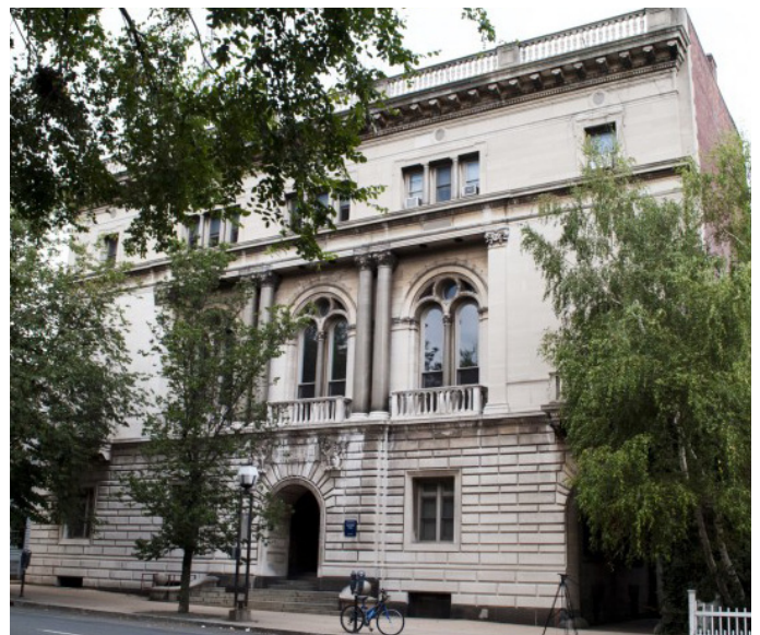
Elm Street's Hendrie Hall, long-time home to the Glee Club, Band, Orchestra, WYBC, and even cap-and-gown rentals.