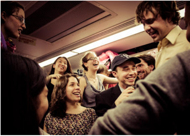
"As the train pulled out of Grand Central"— YGC choristers sing their way home after New York Yale Club holiday concert.