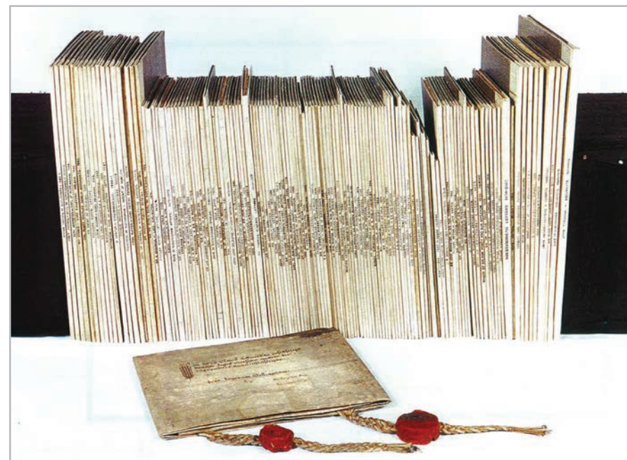
Clayton & Morris Archive