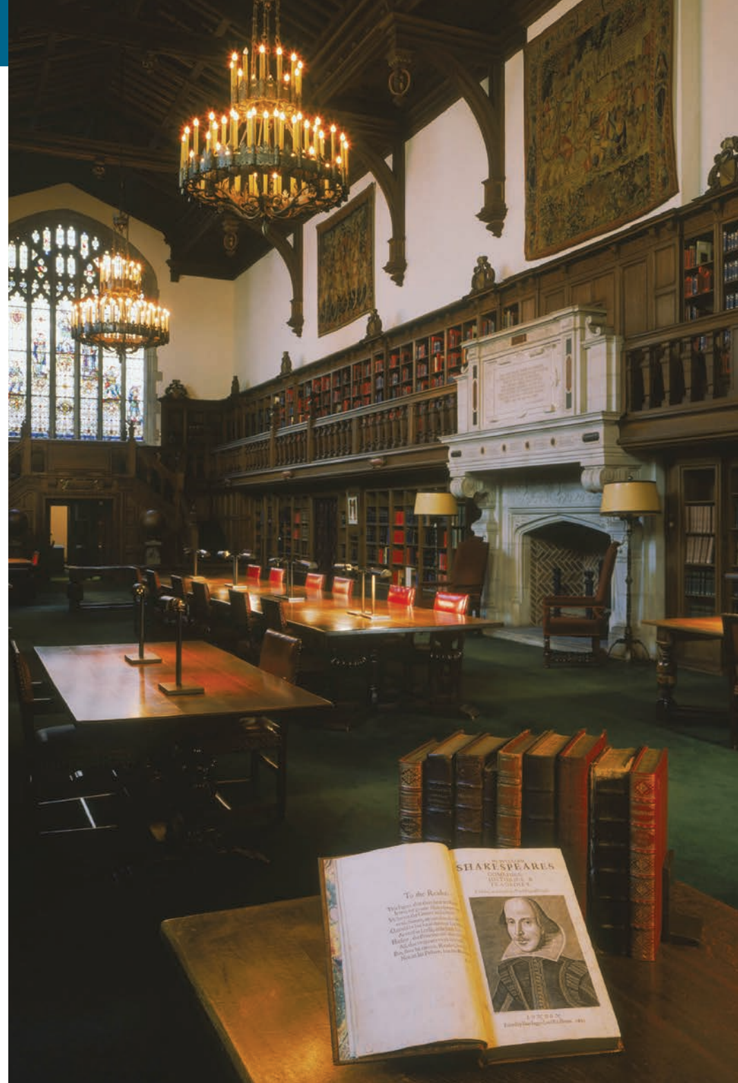
Design by Chroma Design and Communications