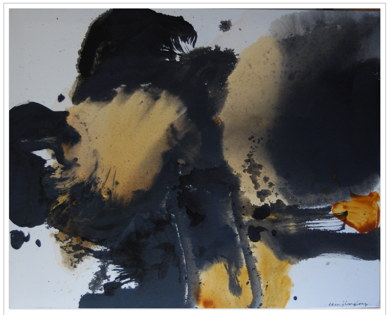
Chen Jiang-Hong, 'Untiled (BA 149)', 2009, mixed media. Image courtesy the artist and Gallery Elena Shchukina.

In the exhibition during Asian Art In London 2016, Rossi & Rossi presents a selection of both antique and contemporary works of art, representative of the scope of artistic practices featured by the gallery, and offering an insight into the development of art in the Himalayan, South and Southeast Asian regions. The juxtaposition of old and new creations allow for an observation of influences, inspiration and cross-pollinations present in the contemporary practices of artists from these areas. An understanding of historical practices is the key to better appreciate the art of today.