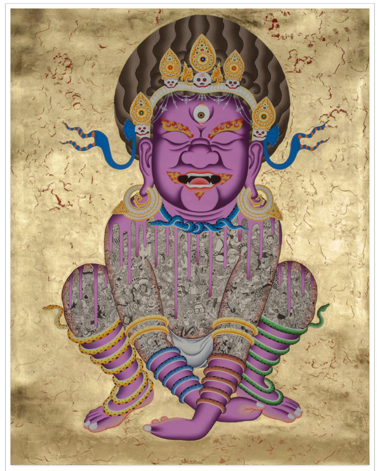
Tsherin Sherpa, 'Contemplation', 2015, gold leaf, acrylic and ink on cotton, 122 \times 98.5 \text{ cm} (48 x 38 in).