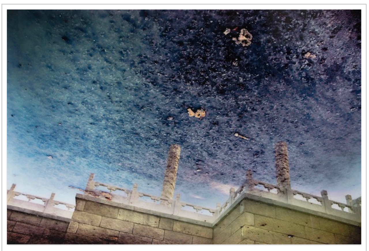
Han Bing, 'Coiled Dragon Pillars', 2007, single exposure C-print photo on aluminium, edition 1 of

Asian Art in London 2016 features a rich programme of talks, lectures, guided visits, auctions, events and shows of Asian art. Art Radar spotlights 9 gallery exhibitions of contemporary Asian art taking place during the 10-day event.