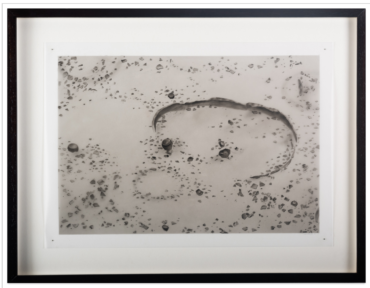
Ali Kazim, 'Untitled (Ruins)', pigments on polyester drafting film, 32 x 42 cm.

As the body, material is also a metaphor for the artist. In this new series, his subject are the ruins of an ancient city near Lahore along the River Ravi. It is the abandoned site of the ancient Indus Valley Civilisation, which today serves as a burial site for local communities. Kazim uses tracing paper and eliminates colour and brushstrokes in his compositions, in order to capture a landscape that is scattered with terracotta pieces and pottery shards come to light with the monsoon rain. Jhaveri Contemporary quotes the artist as saying: