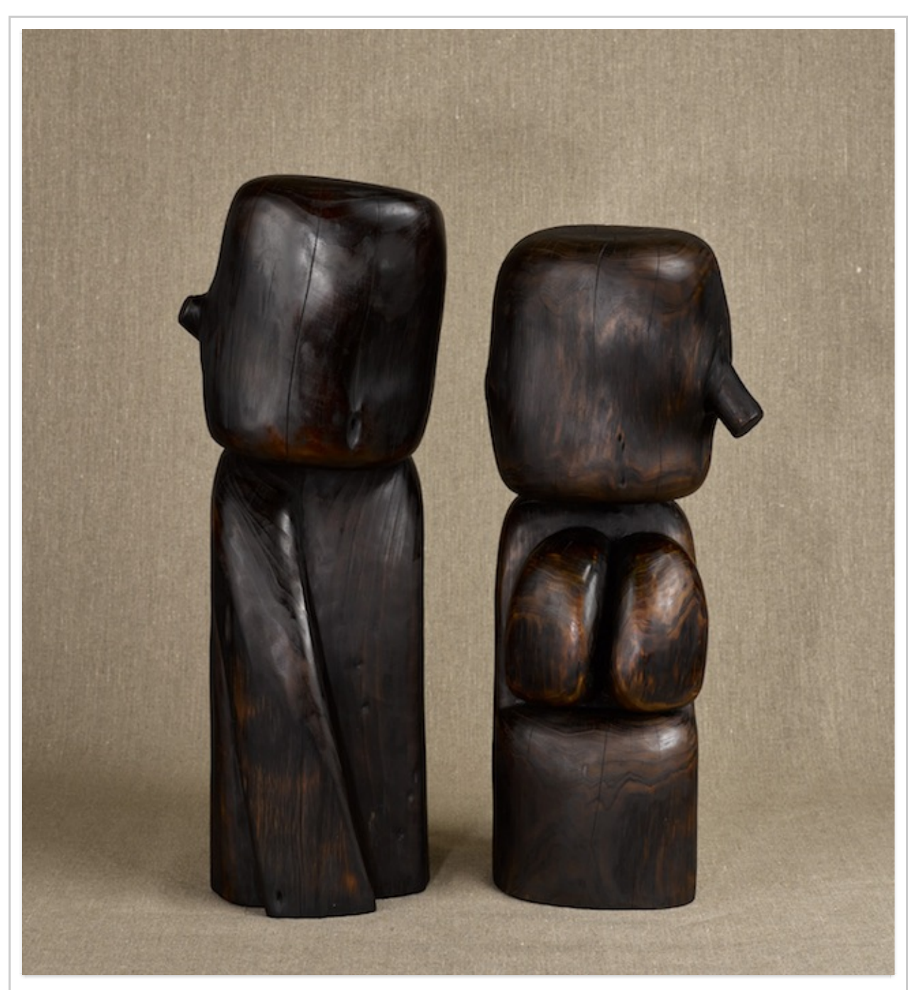
Wang Keping, 'Couple', 2012, cedar, wood. Male: 66 \times 23 \times 25 cm; Female: 61 \times 26 \times 19 cm. Monogrammed on each base. Provenance: Artist's estate.

"China Black" features a selection of ten Chinese ink paintings by Zao Wou-Ki, ranging from 1950 through to 2000, providing a fascinating insight into the span of Zao's artistic practice, shown alongside a group of 16 sculptures by Wang Keping .