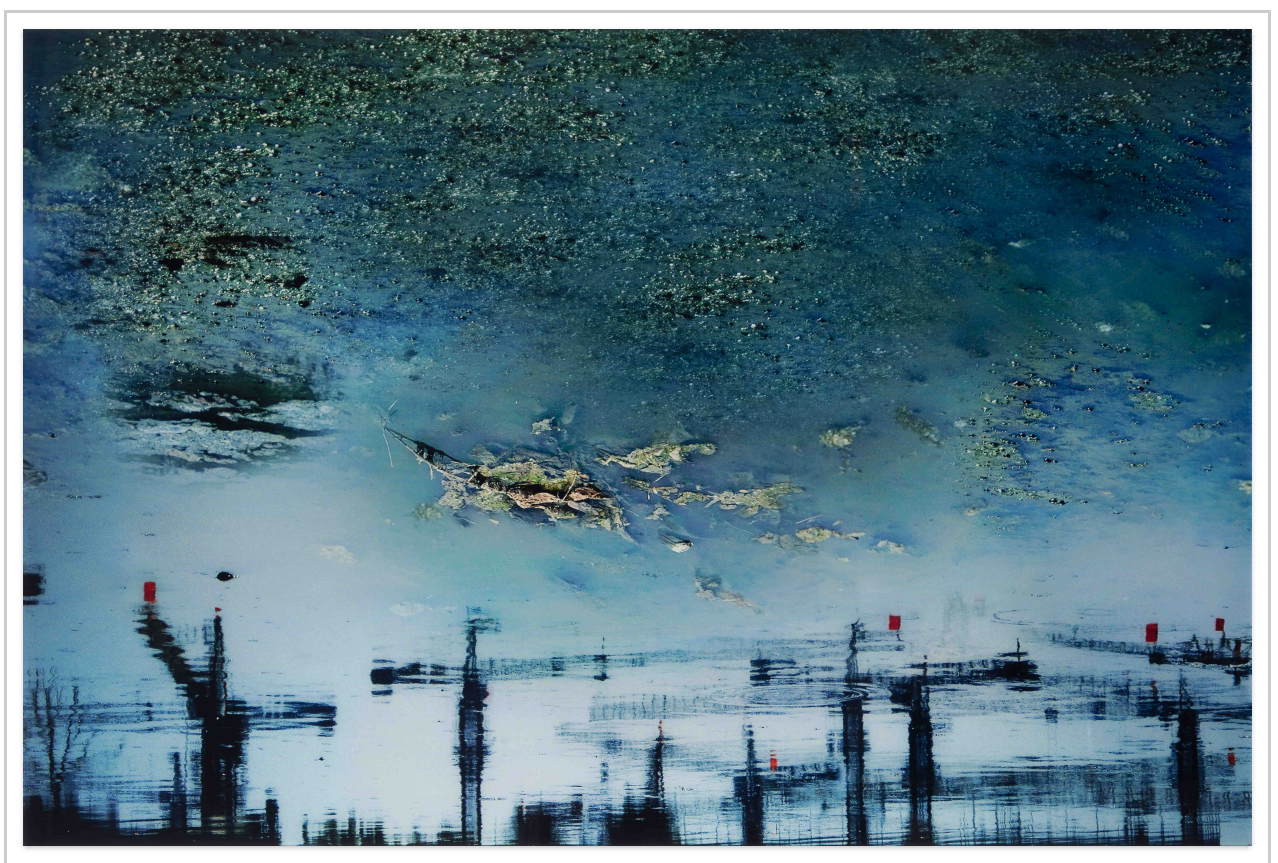
Han Bing, 'Red Flags Flying on Skyline Cranes', 2005, single exposure C-print photo on aluminium, edition 1 of 6, 100 \times 150 cm. Image courtesy the artist and FitzGerald Fine Arts.

The photographic series visualises the drama of China's transformations as the nation goes through what the artist calls the "theatre of modernization". The images, which at first glance seem digitally enhanced and retouched, are single exposure photographs of reflections in toxic waters and cesspools.