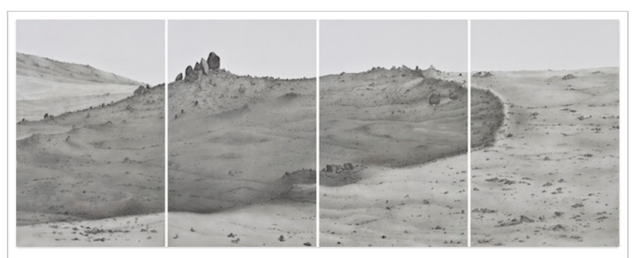
Ali Kazim, 'Untitled' (From the "Otherland" Series), watercolour pigments on paper, 152 \times 457 cm. Image courtesy the artist and Jhaveri Contemporary.