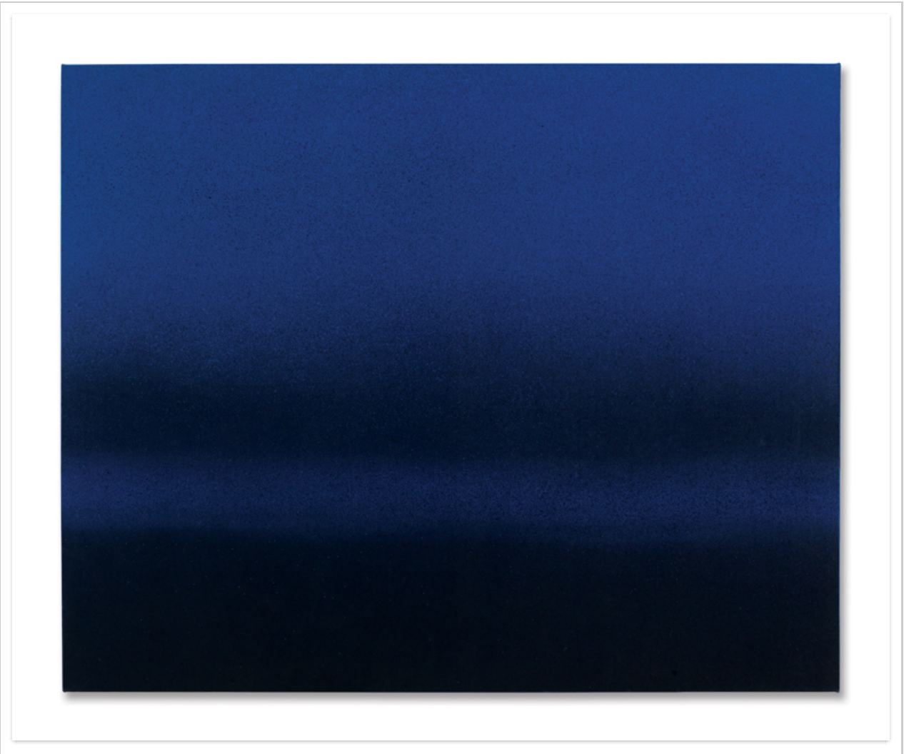
Jiang Dahai, 'Limitless', 2016, acrylic on canvas, 130 \times 160 cm.

In his painting practice, Jiang has assimilated both Eastern and Western art forms. Composing meditative tableaux that have become known as 'cloud paintings', the artist paints with a method the echoes the Abstract Expressionist action painting, building his canvases with up to 15 layers of colour.