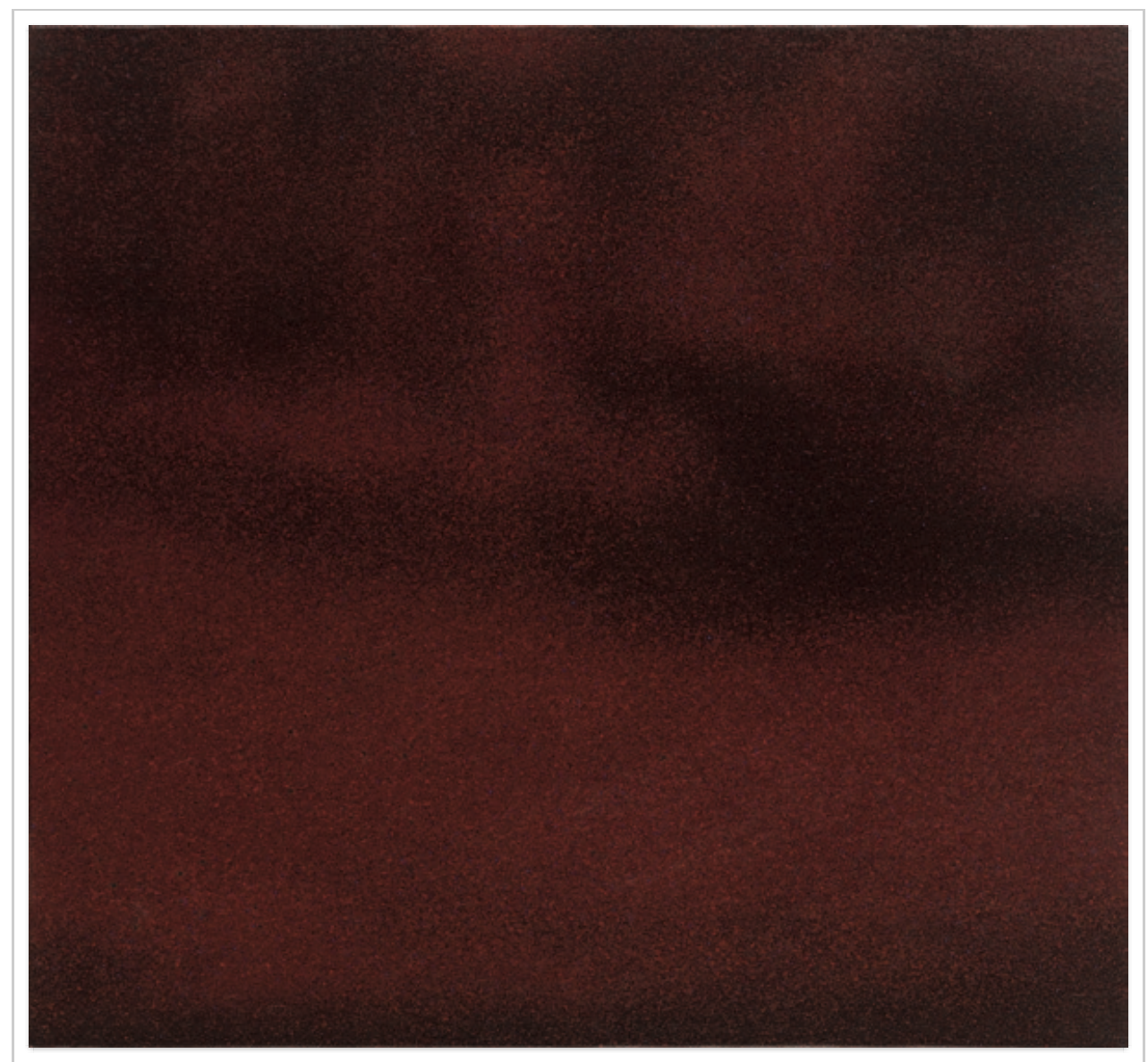
Jiang Dahai (b.1946), 'Red Obscure', 2016, acrylic on canvas, from AAL 2016 exhibition "Jiang Dahai – Diffusion" at Mayor Gallery.