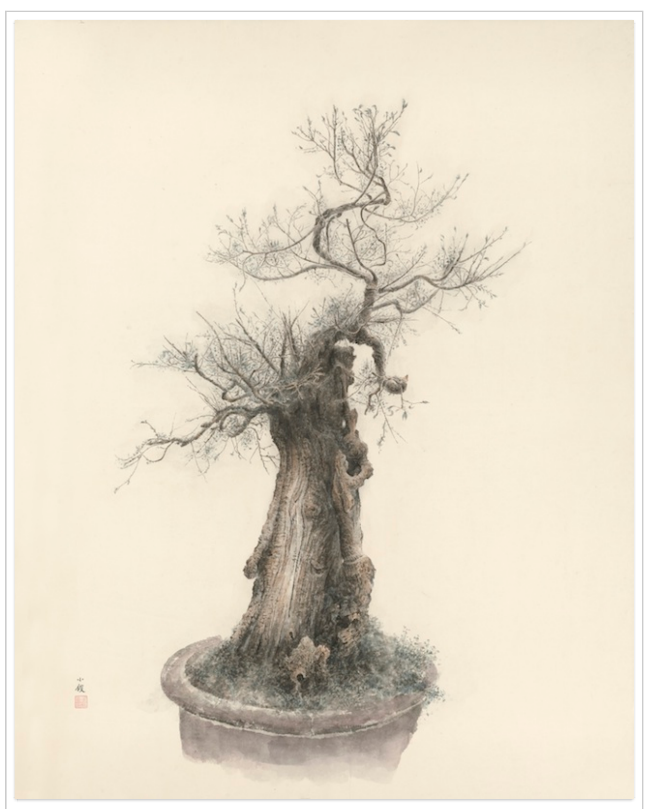
Zeng Xiaojun, 'Penjing I', ink and colour on paper, 180 x 138 cm. Signed: Xiaojun. Artist's seal: Painted by Zeng Xiaojun.

Wang Keping , who spent more than 30 years living in Paris, is one of China's first contemporary sculptors. He was born in 1949 in Beijing and entered the contemporary art scene in the late 1970s alongside fellow artists Huang Rui , Ma Desheng , and Ai Weiwei as a founding member of the early Beijing contemporary art group The Stars (Xing Xing), which championed artistic freedom in China. His wooden sculptures range from 30 centimetres in height to monumental scale, and evoke "sensual beauty, grotesque deformity and sublime abstraction".