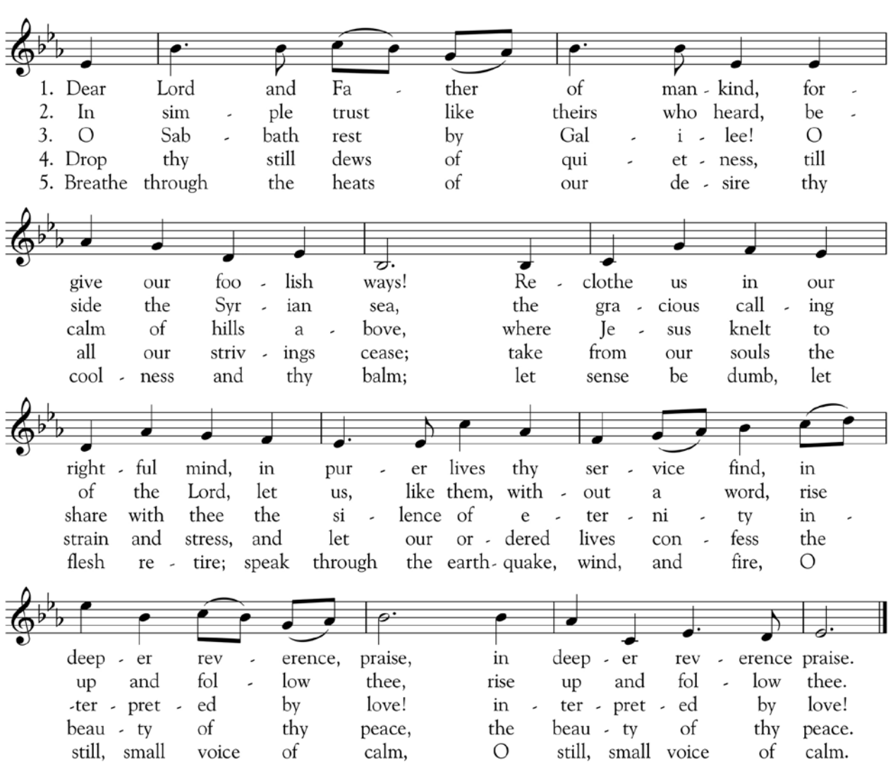
The All Saints' Adult Choir