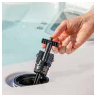
The maintenance-free cartridge can be replaced in seconds, without tools.

The FreshWater Salt System will change the way you use your hot tub by taking the worry out of water care. With water that's always hot and ready to use, you'll spend less time maintaining your spa and more time using it.