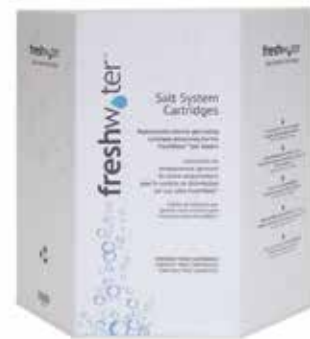
One 3-pack of cartridges provides a year's worth of water care.*