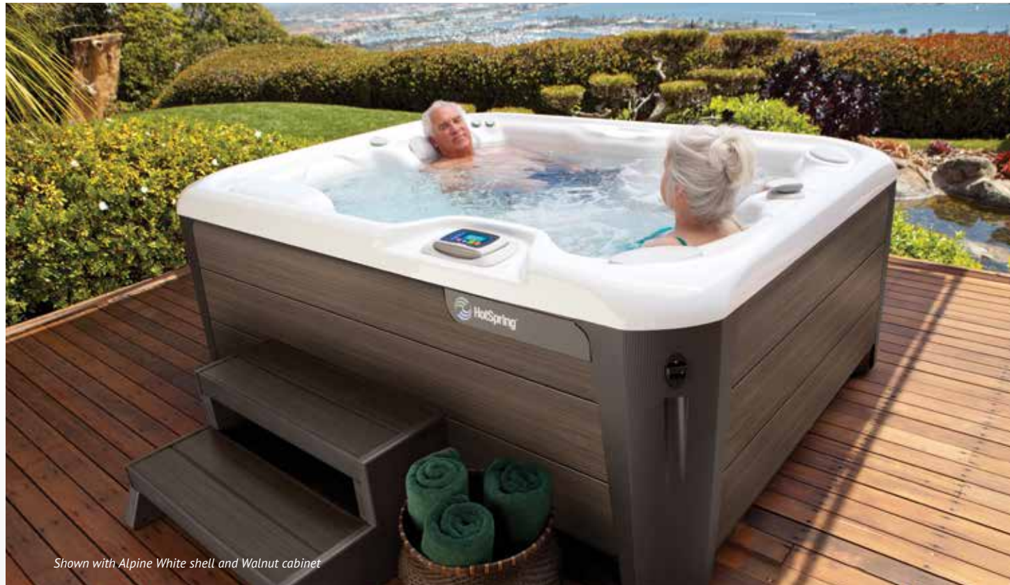
Shown with Alpine White shell and Walnut cabinet