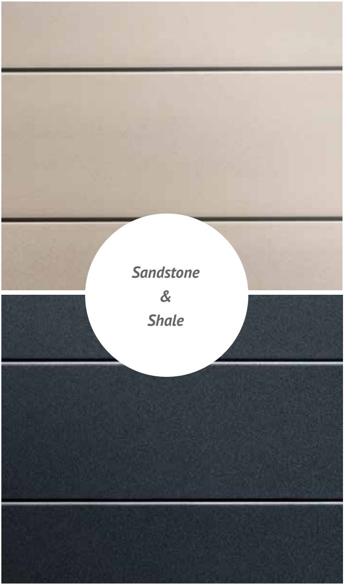
Sandstone & Shale

A metallic sheen in the Brushed Nickel comes to life when sunlight reflects on its textured finish. A satin finish on the Bronze siding creates an exciting backyard focal point.