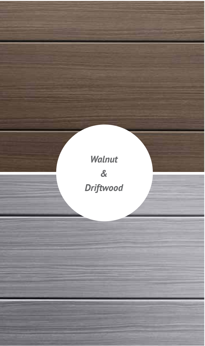
Walnut & Driftwood