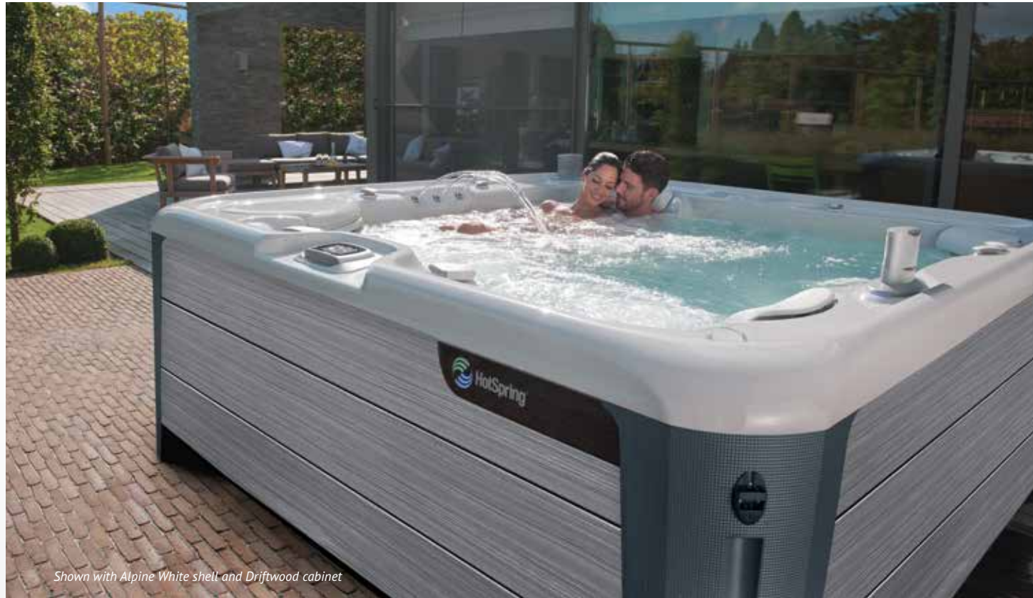
Shown with Alpine White shell and Driftwood cabinet