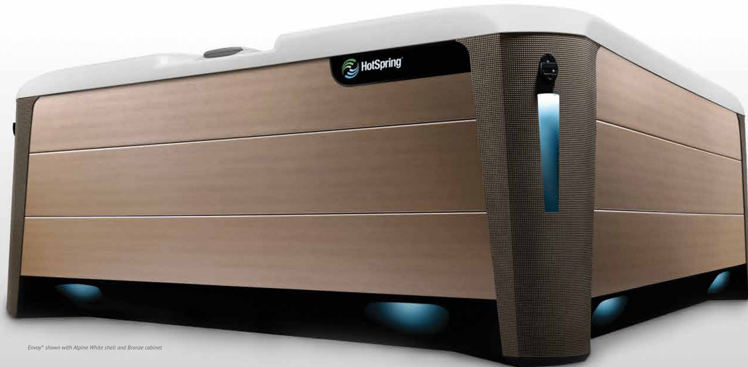
Envoy® shown with Alpine White shell and Bronze cabinet

Built for Years of Use Polymer support structure and base pan for durability and long life