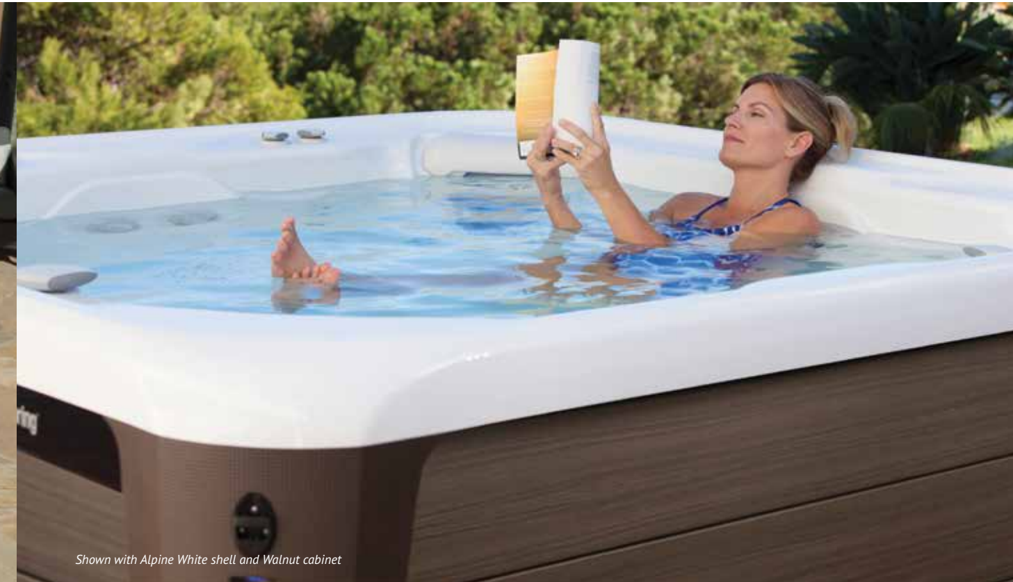
Shown with Alpine White shell and Walnut cabinet