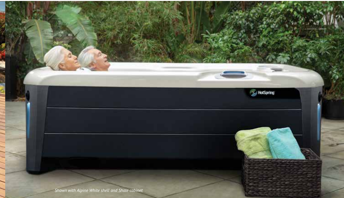
Shown with Alpine White shell and Shale cabinet