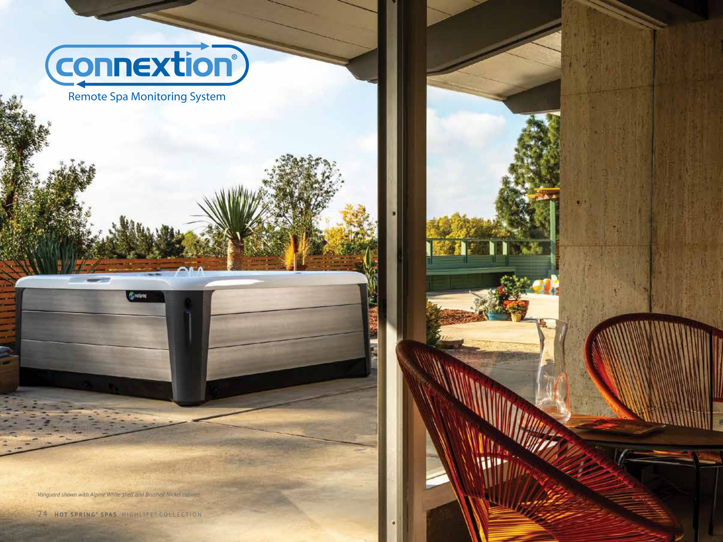
Vanguard shown with Alpine White shell and Brushed Nickel cabinet