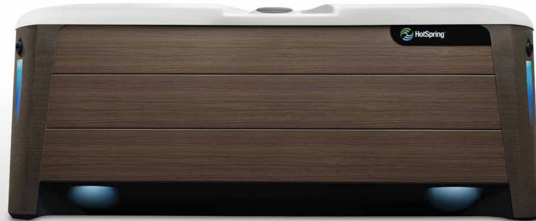
Envoy® shown with Alpine White shell and Walnut cabinet

The sides of the base pan are elevated to create a barrier to the elements. It also gives the spa its unique floating effect, which is made extra special with under-cabinet accent lighting.