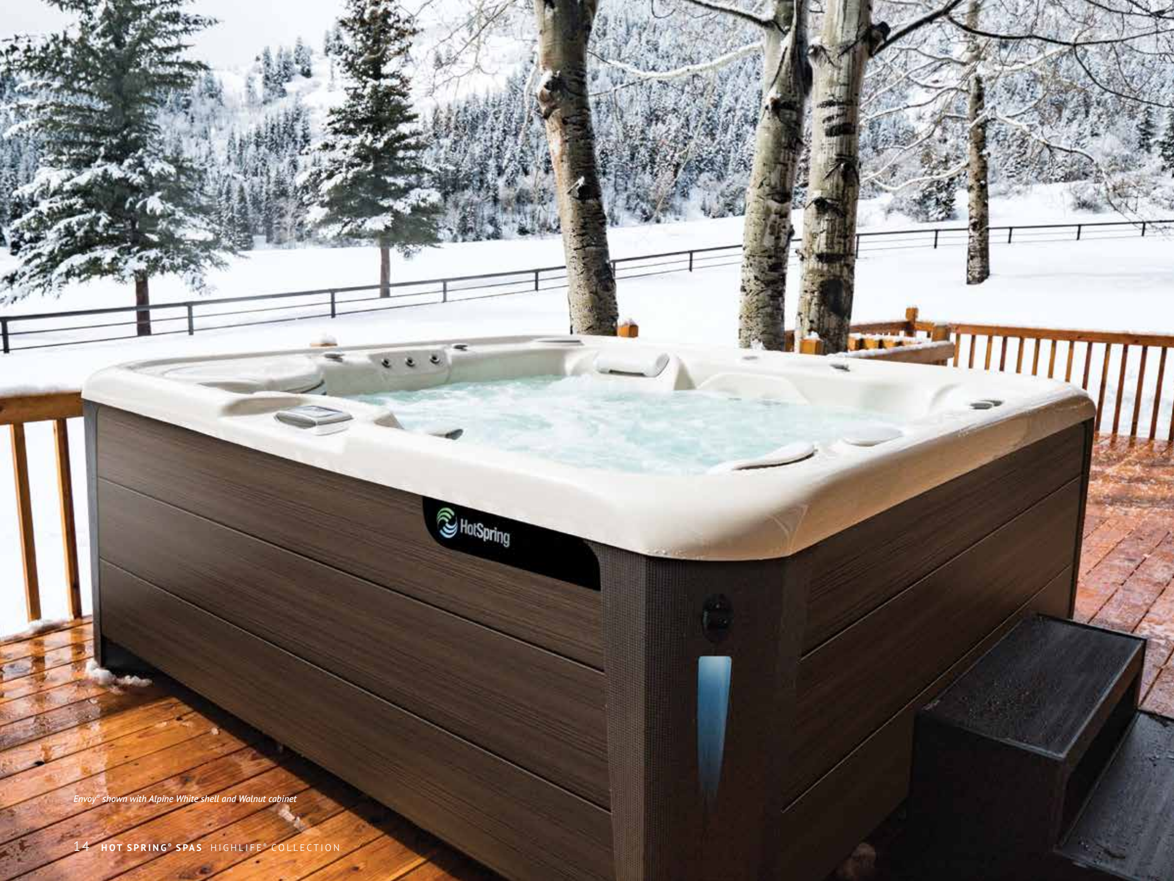
Envoy® shown with Alpine White shell and Walnut cabinet