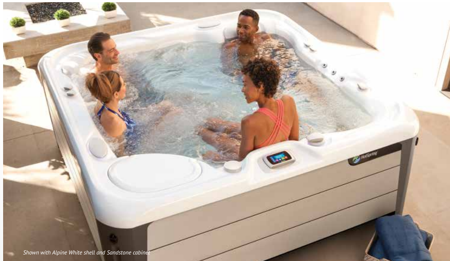
Shown with Alpine White shell and Sandstone cabinet