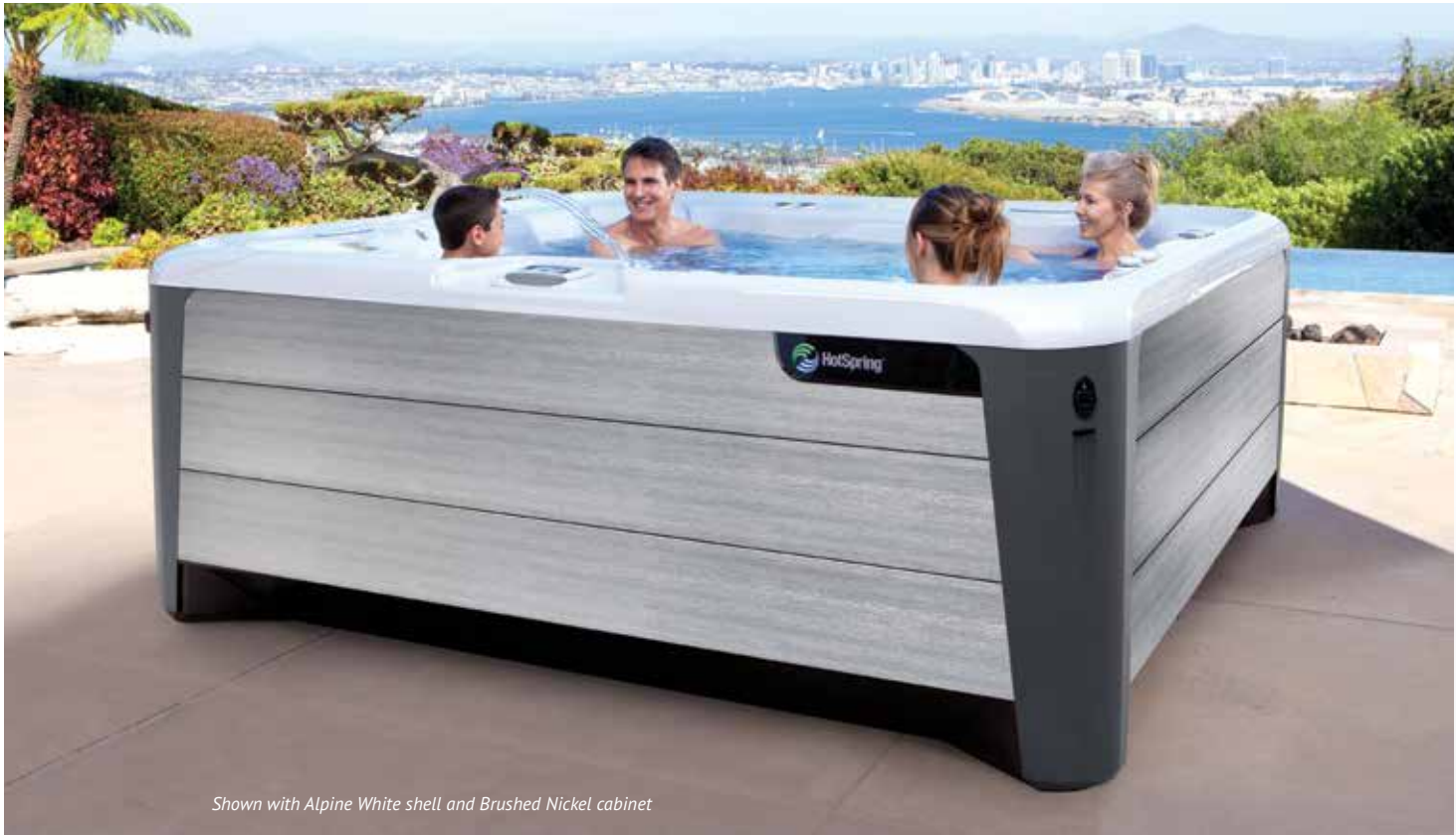
Shown with Alpine White shell and Brushed Nickel cabinet