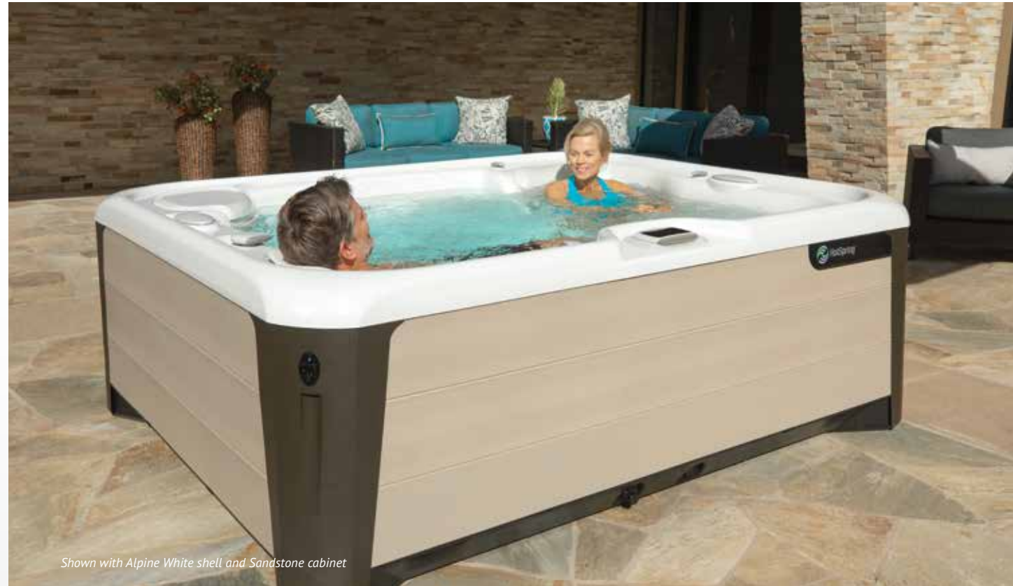
Shown with Alpine White shell and Sandstone cabinet