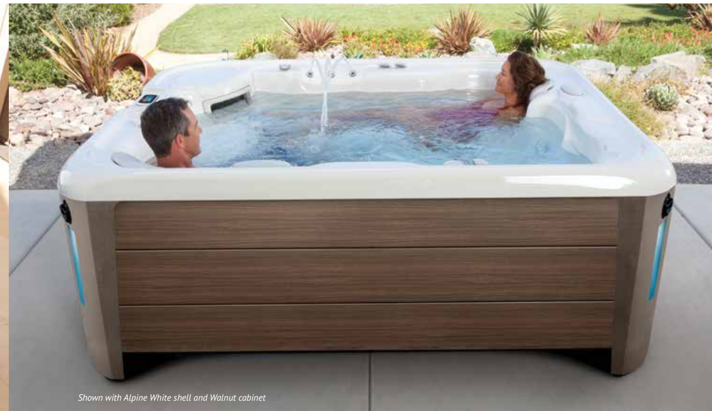
Shown with Alpine White shell and Walnut cabinet