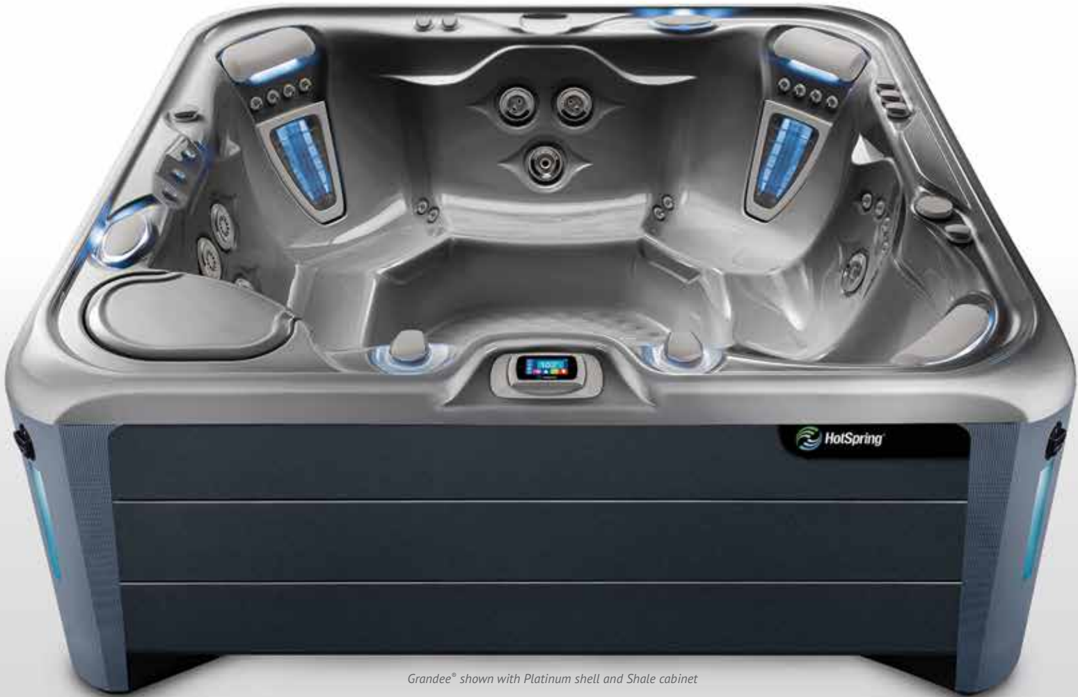
Grandee® shown with Platinum shell and Shale cabinet

Six cabinet finishes include textures and tones influenced by wood, metal and stone. Combine those with a variety of designer-selected shell color combinations and you can create a look that's just right for you, from traditional to cutting-edge contemporary.