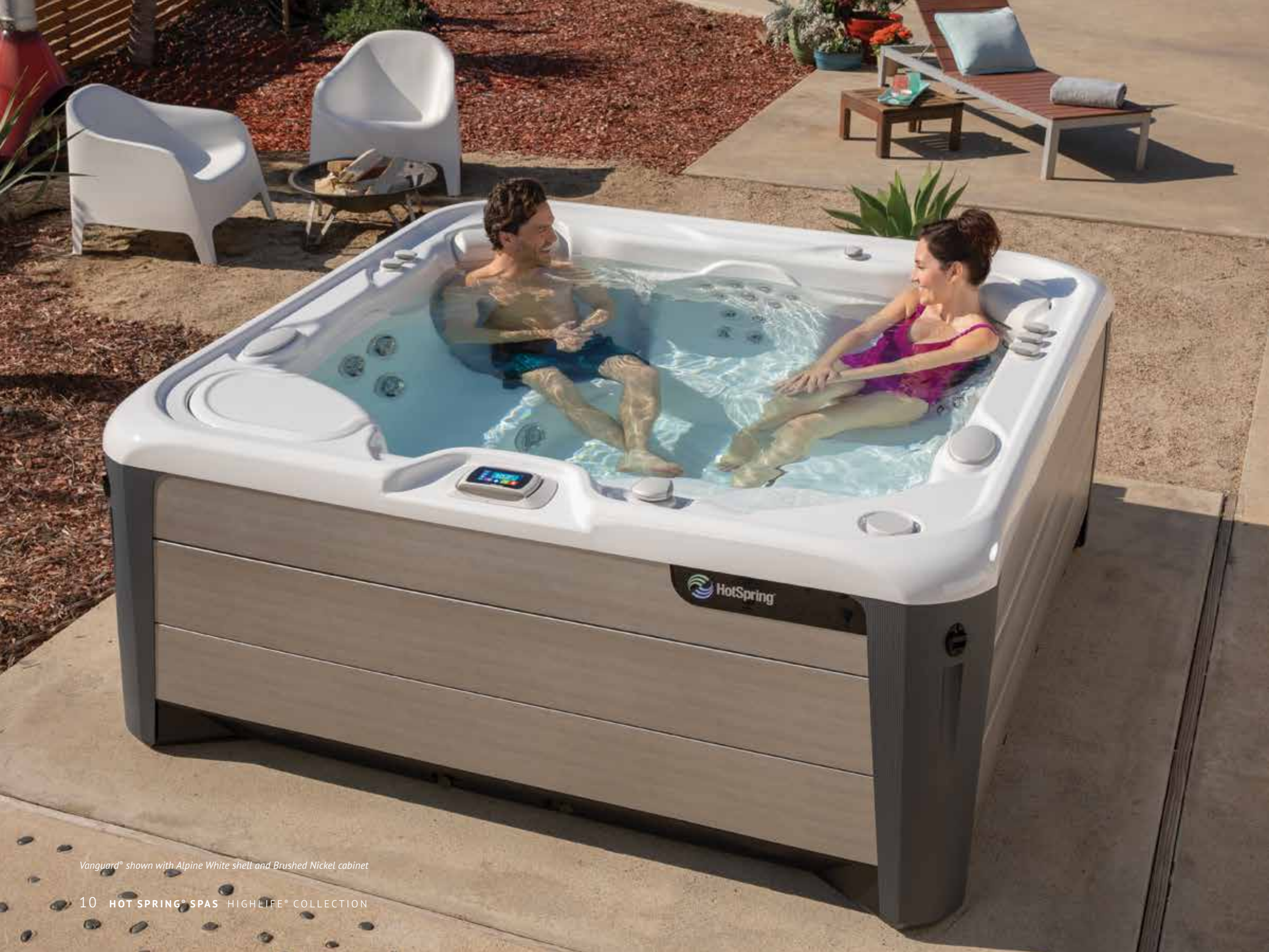
Vanguard® shown with Alpine White shell and Brushed Nickel cabinet