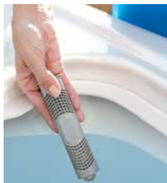
For the ultimate water care solution, add a FreshWater Ag+ silver ion cartridge to further reduce the need for chemical sanitizer.**