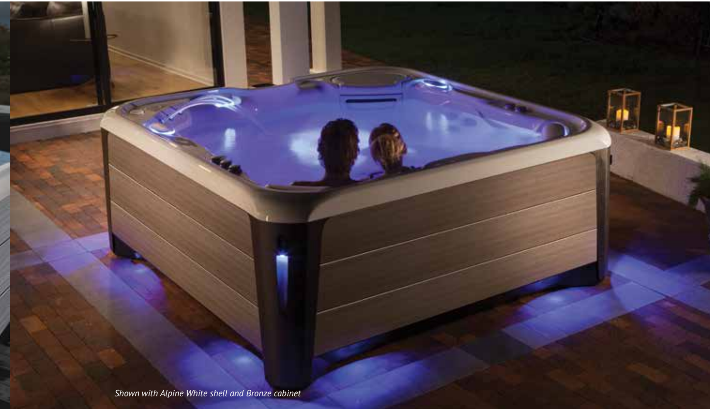
Shown with Alpine White shell and Bronze cabinet