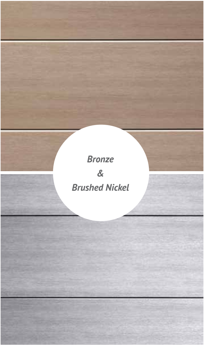
Bronze & Brushed Nickel

With their subtle grain pattern and natural color tones, these two wood-pattern options complement a wide range of home and patio styles.