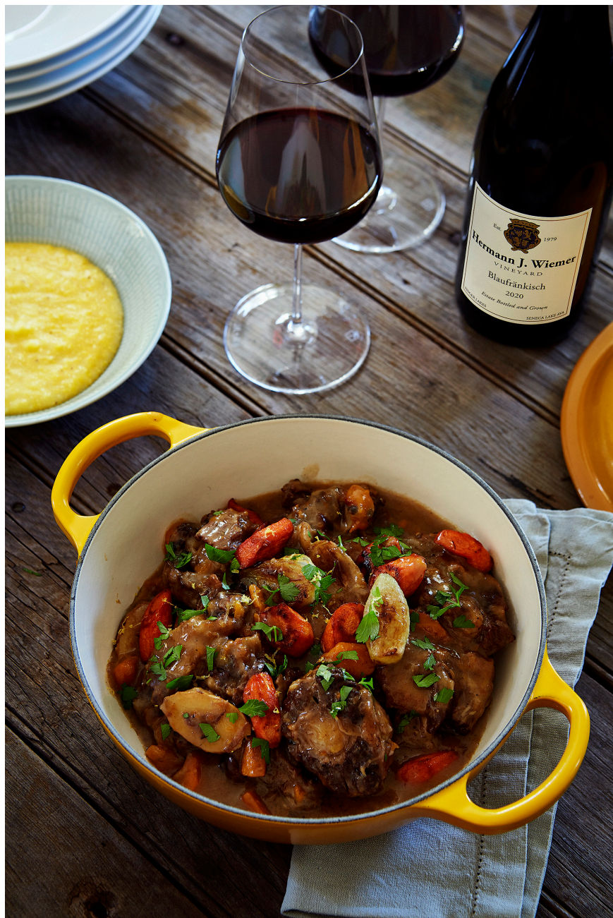
Instant Pot Braised Ox Tail, Carrots, Shallots, Lemon & Parmesan-Polenta