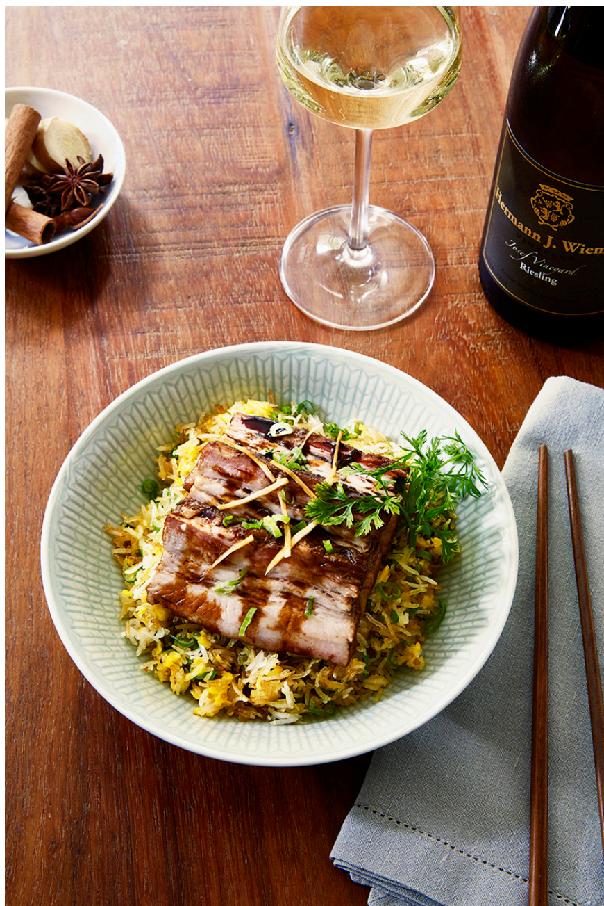
Roast Pork Belly with Sweet Soy, Scallion & Egg Fried Rice