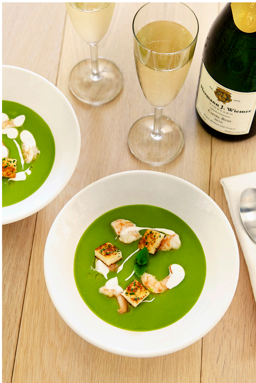
Chilled Pea Soup with Shrimp, Mint Cream & Brioche Croûtons