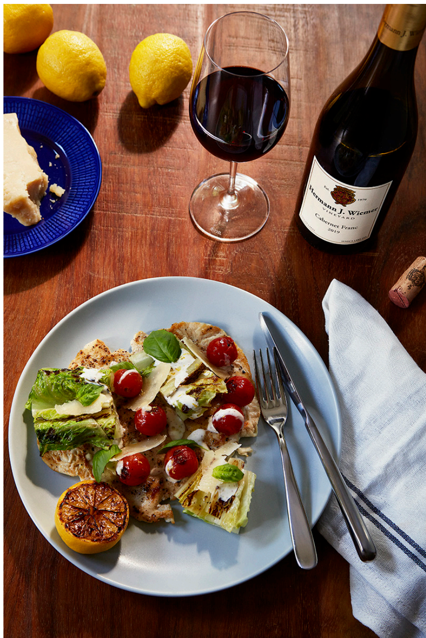
Lemon & Basil Chicken Paillard. Grilled Romaine Lettuce. Blistered Cherry Tomatoes. Parmesan Dressing