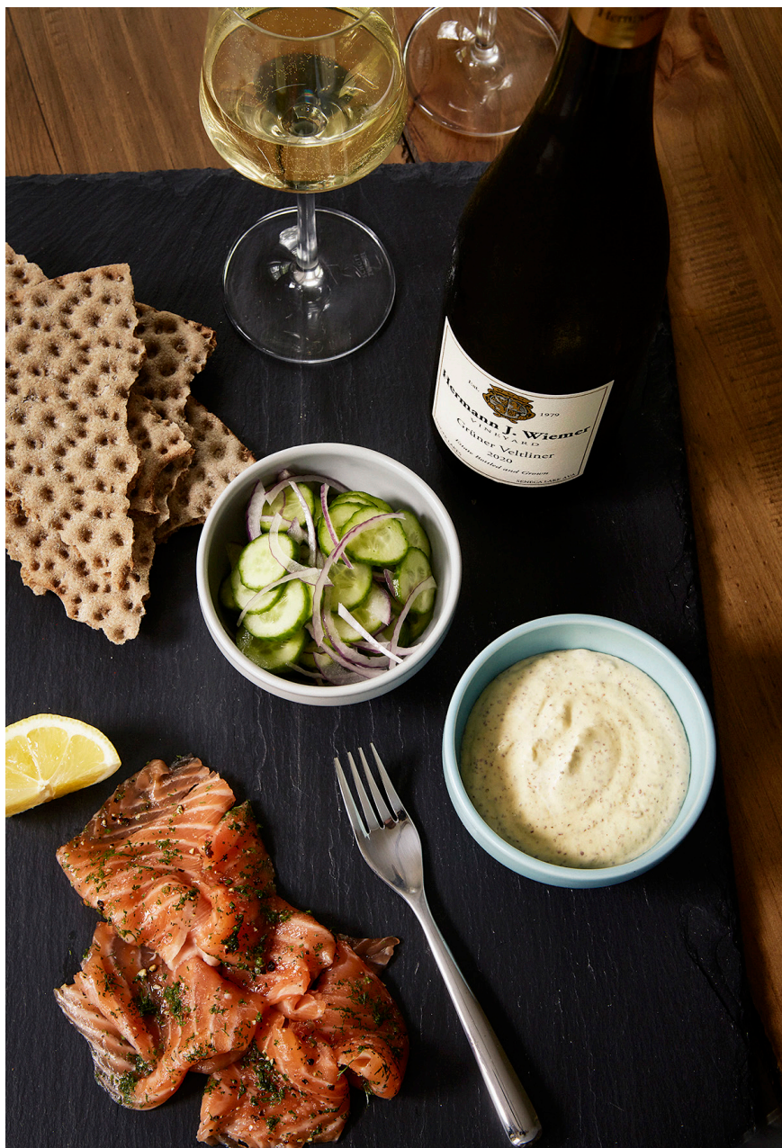
Quick Cured Salmon with Cucumber & Red Onion Salad & Mustard Sauce