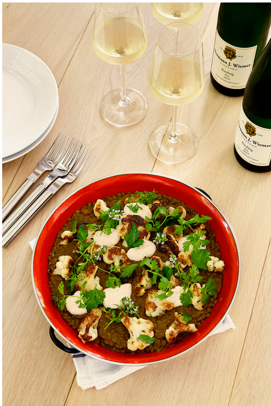
Roasted Cauliflower with Creamy Lentils & Spiced Yogurt