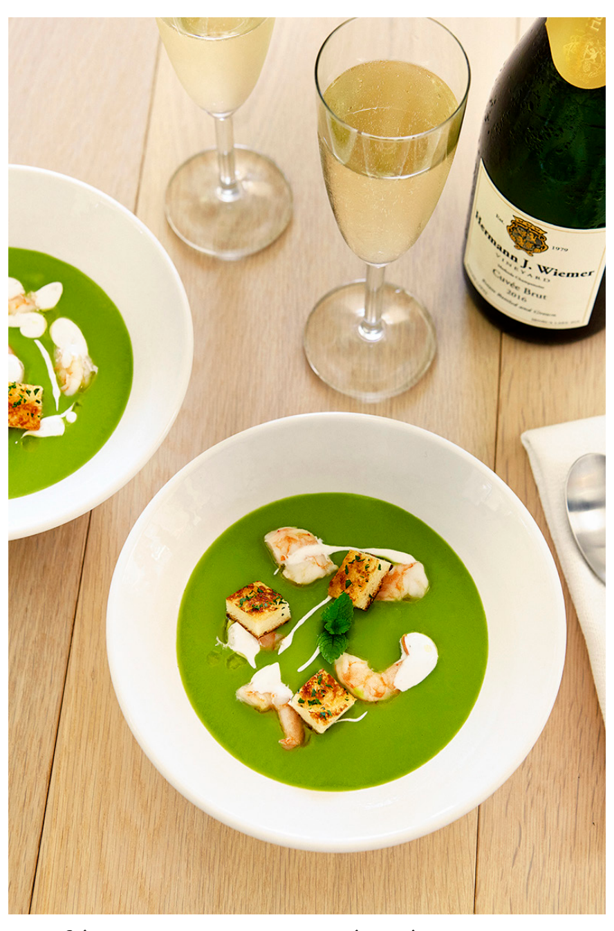
Chilled Pea Soup with Shring. Mint Cream & Brioche Crontony