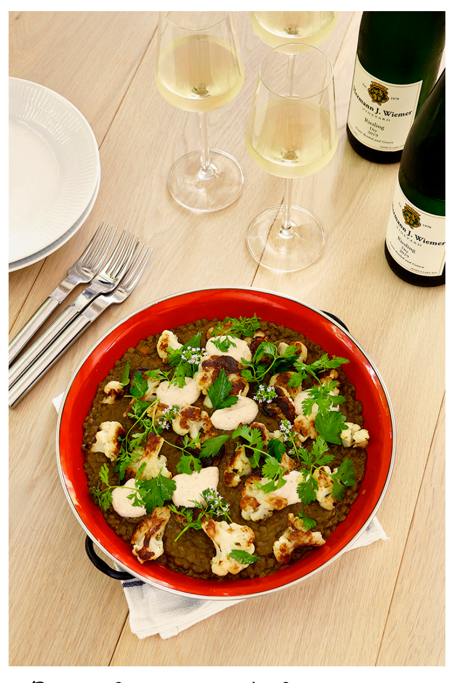
Roosfed Cauliflower with Creamy Lentile & Spiced Yogurt