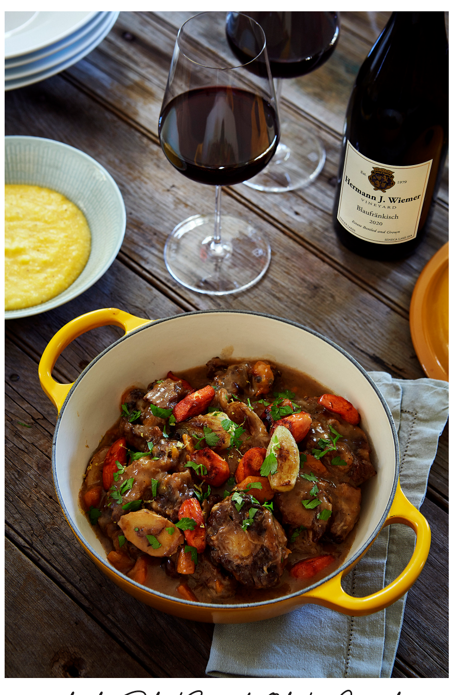
Instant Pot Braised Ostail. Carrots. Shallots. Lemon & Parmesan-Polenta