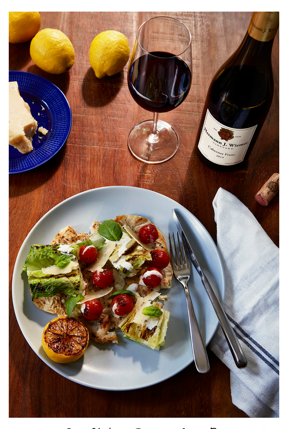
Lemon & Bazil Chicken Paillard. Grilled Romaine Lettace. Blistered Cherry Tomatoez. Parmezan Dreszing