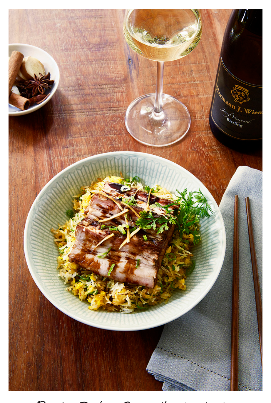
Roost Pork Belly with Sweet Soy. Scallion & Egg Fried Rice