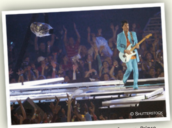
Super Bowl halftime shows feature top performers. Prince performed at the 2007 Super Bowl in Miami.