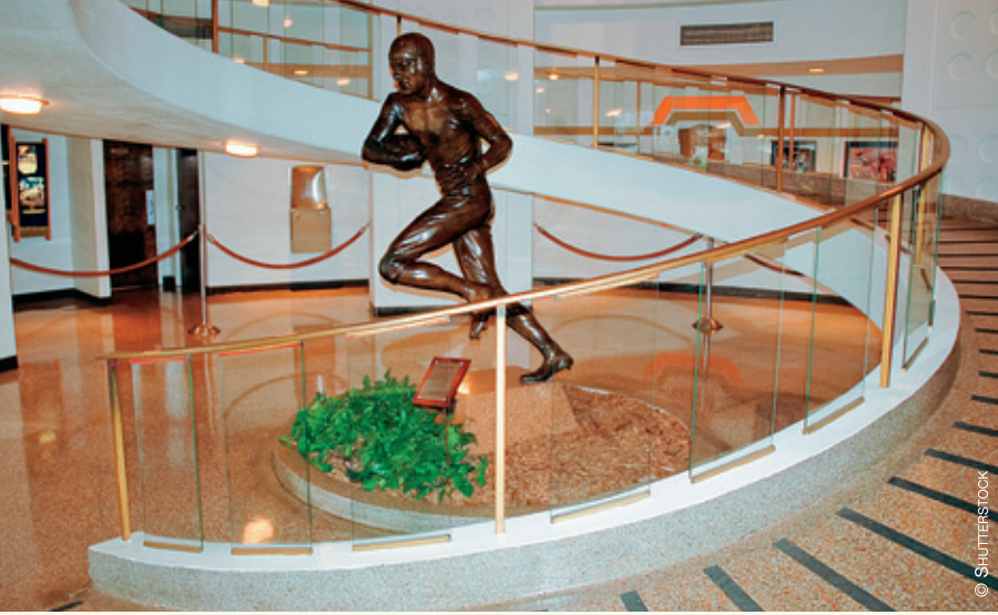
This statue of Jim Thorpe, pro football's first superstar, stands in the rotunda of the Pro Football Hall of Fame in Canton, Ohio.

Football includes social events that extend well beyond the grandstands. High schools and colleges often hold pep rallies the night before a big game to rev up the faithful with bonfires, cheers, and pep talks by the players and coach. Homecoming celebrations welcome alumni back to campus for a weekend of parties, dances, and an important game, usually against an archrival.