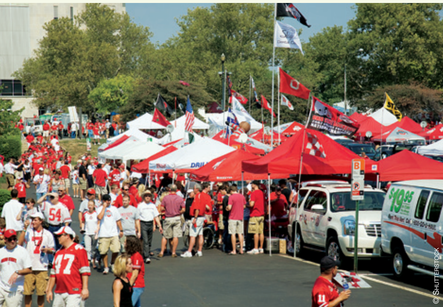
Fans attend a large tailgate party before an Ohio State University football game.

vate homes to watch the game and share their excitement with fellow enthusiasts. Some holidays, such as Thanksgiving and New Year's Day, which feature day-long broadcasts of games, can be as much about football as traditional celebration.