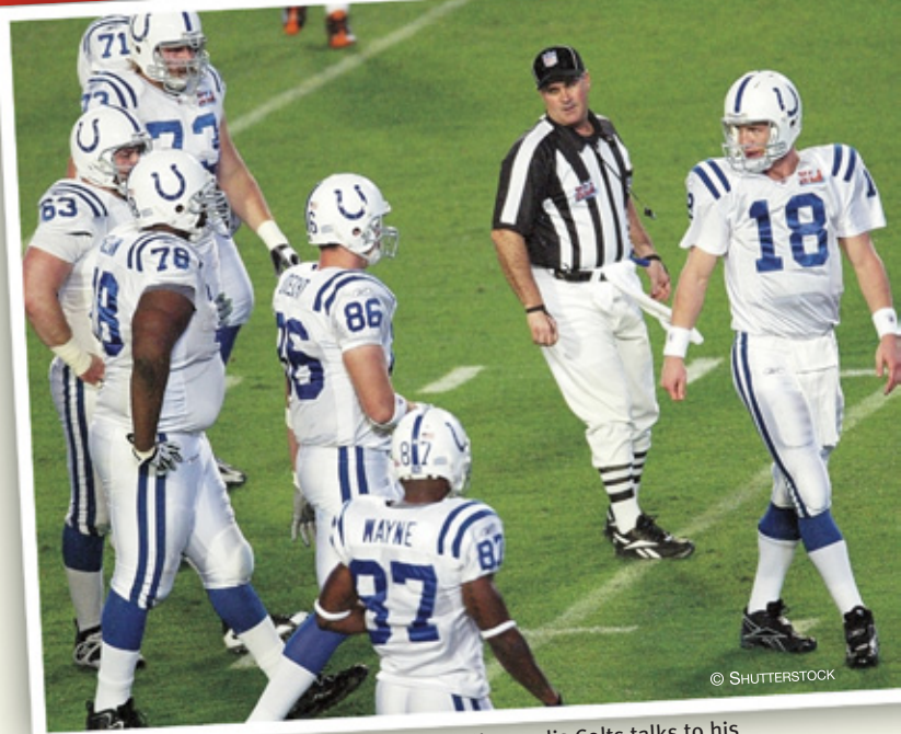
Quarterback Peyton Manning (#18) of the Indianapolis Colts talks to his teammates on the field during the 2007 Super Bowl. The Colts won the game, defeating the Chicago Bears.

Super Bowl Sunday has, in effect, become America's newest national holiday.