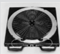
Item No. 1 690 401 011