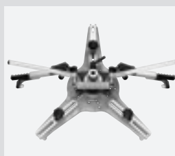
Item No. 1 690 501 250

4 multi-quick clamps, suitable for all rims from 13" to 24" diameter.