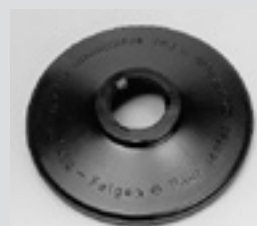
Spacer ring for wide rims with large dish depth (for 825 DT).