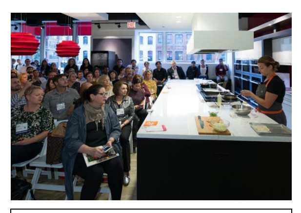
31: Kitchen trends and tastings with Miele (133), Traditional Home and Girl & the Goat.