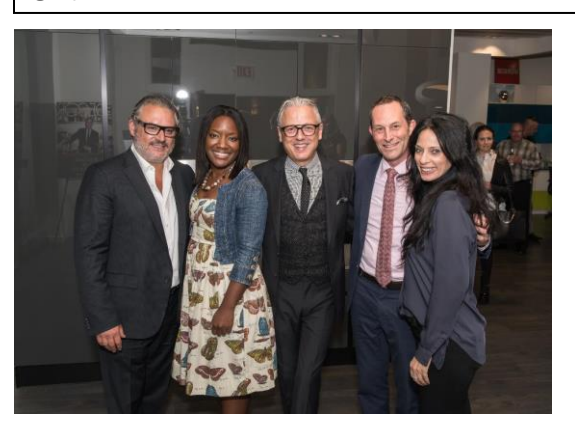
41: Scavolini (110) Happy Hour with Elle Décor!