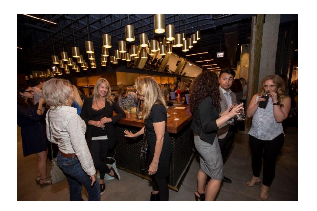
48: Chairs for Charity