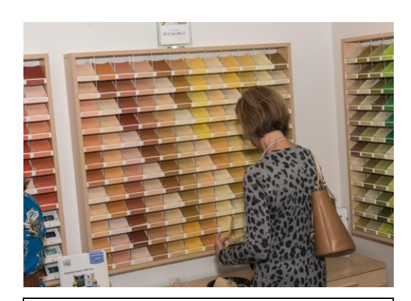
26: Making a stop at Sherwin Williams (163) for color inspiration during Design Chicago.