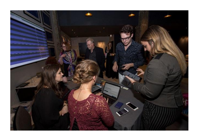
50: Chairs for Charity