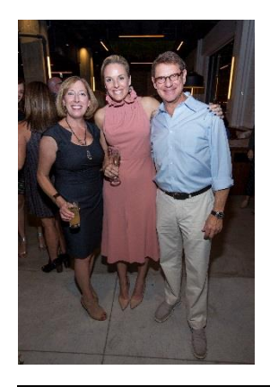
47: Chairs for Charity