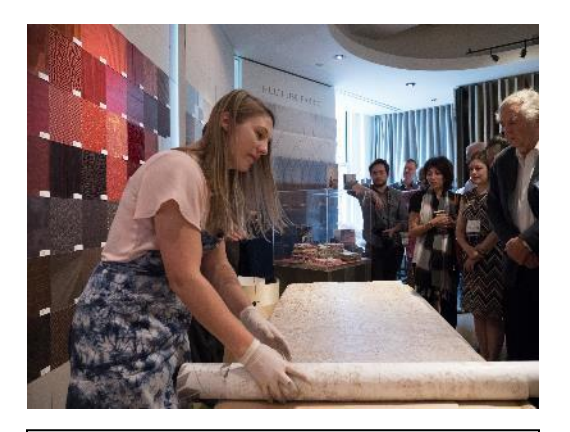
2: An artisan from the Maya Romanoff Chicago studio created wallcoverings for the live audience.