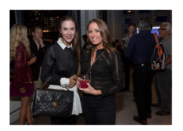
46: Chairs for Charity