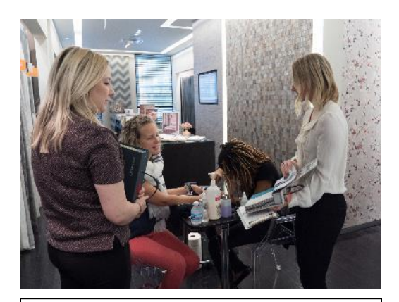
13: Timeless and sophisticated – design fabrics and wallcoverings from ROMO (6-152).