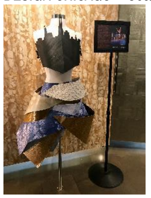
1: Design Chicago kicks off at Maya Romanoff (6-167) with a CEU on 20^{\text{th}} and 21^{\text{st}} century wallcoverings.