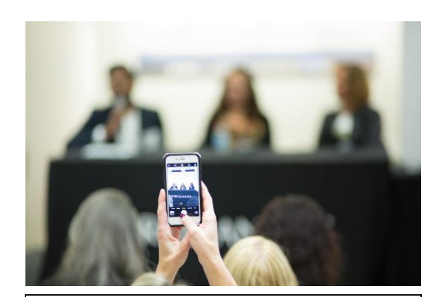
39: Getting social PORCELANOSA (149) with Metropolis Magazine discussing how to get published.