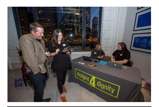
42: More than 375 attendees joined the 8th annual Chairs for Charity, where Chicago's top designers gave new life to vintage chairs – and auctioned them off, with all proceeds benefitting Designs for Dignity.