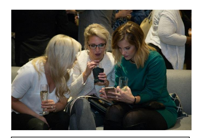
51: Chairs for Charity