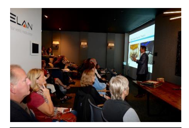
10: New showroom Artisan Electronics Group (1486) presented two CEUs during Design Chicago on designing a home theater, as well as the art of hiding technology.