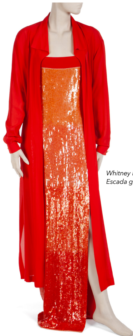
Whitney Houston's Escada gown