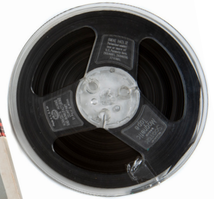
David Bowie's 1966 unreleased studio recordings