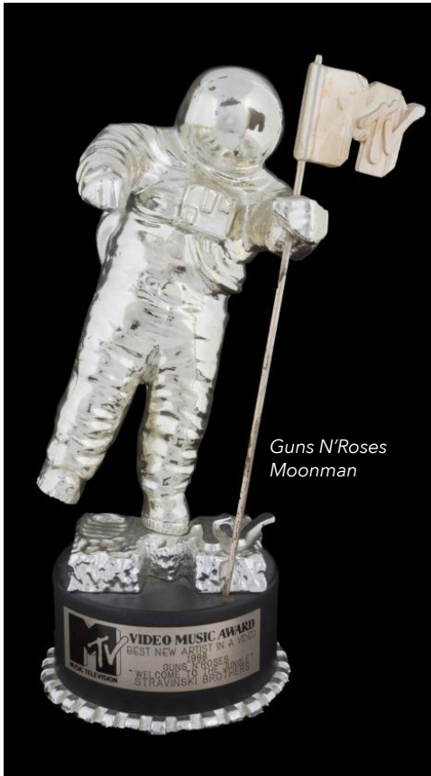
Guns N'Roses Moonman

Bass guitar legend and founding member of the greatest jam band of all time, the Grateful Dead, Phil Lesh's most signature instruments, graphic jackets, sweaters, armbands, amplifiers, speaker cabinets and road cases will make an appearance. Highlights include Lesh's double rack road case housing custom made amplifiers including a pair of PIE model M87 power amps by Andy Hefley (estimate: $2,000-$3,000); a Kurzweil MIDIboard keyboard within a fitted road case (estimate: $1,000-$2,000); Lesh's woven satchel, seven Pall Mall cigarette packages, and a carved wooden box containing 25 Dunlop Adamas graphite guitar picks (estimate: $800-$1,200); a tie-dyed Brooklyn Cyclones baseball jersey with "LESH" written on the back and a Lee blue denim jacket with a large Grateful Dead Lithuania basketball logo; a Gap blue denim jacket with a Peace & Music pin and a Flying Eyeball enamel pin by Kingpin with a Grateful Dead "Only Love Can (Phil)" happy halloween 99" gray sweatshirt and more.