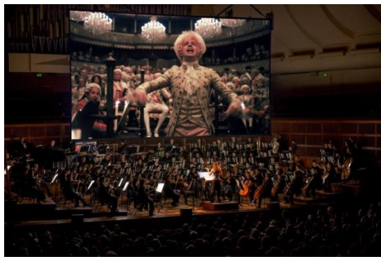
(High-resolution images for the San Francisco Symphony's Film Series are available for download from the Online Press Kit. West Side Story © 1961 Metro-Goldwyn-Mayer Studios Inc. All rights reserved.)