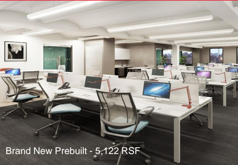
Brand New Prebuilt - 5,122 RSF