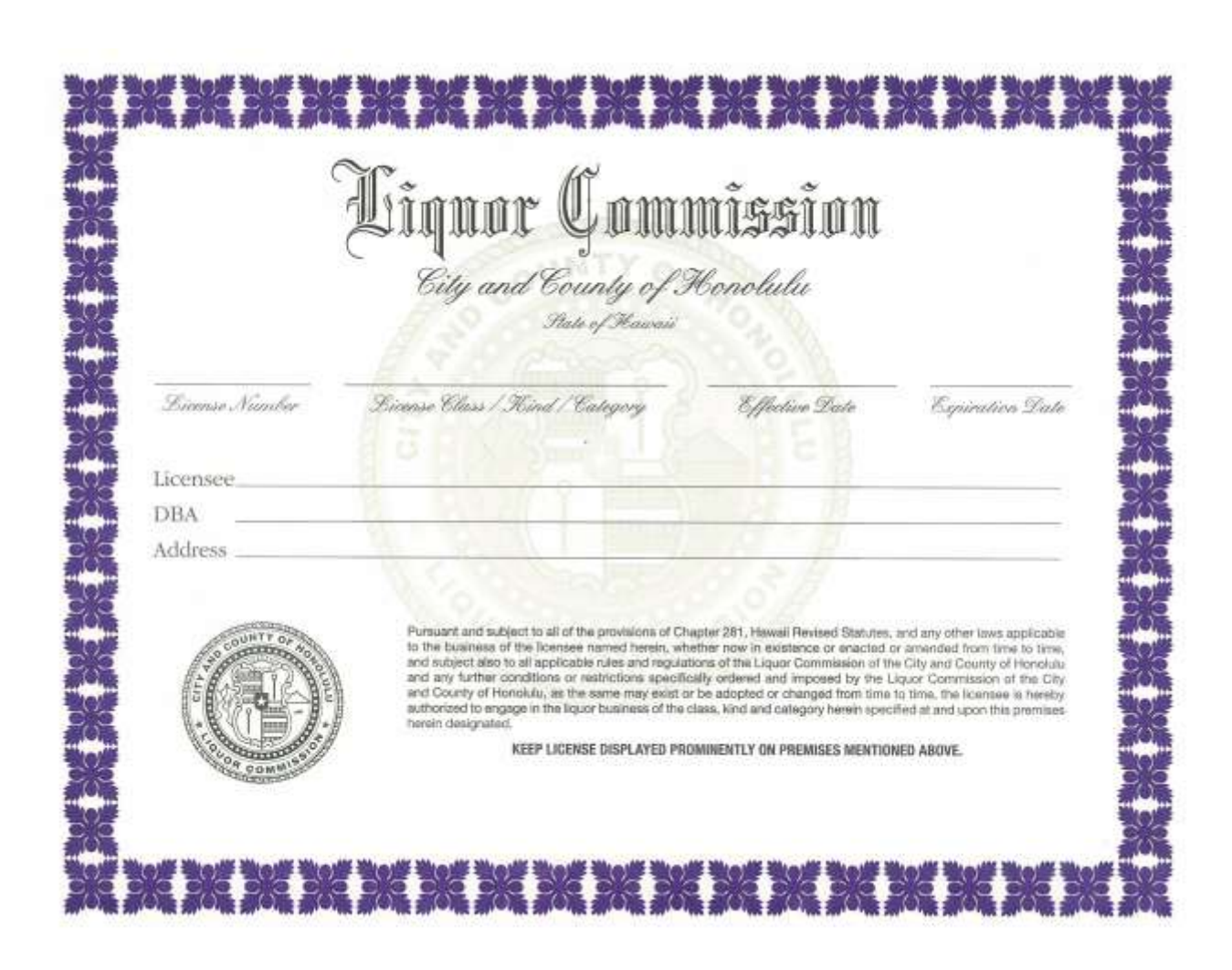
Sample 2013 Liquor Commission License