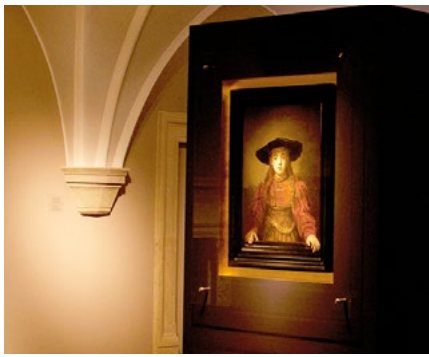
Rembrandt's painting Girl in a Picture Frame (1641), Rembrandt, part of the Royal Castle collection since 1994