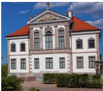
The Fryderyk Chopin Museum holding the world's largest collection of his memorabilia is the most important one.

Every five years, the International Fryderyk Chopin Piano Competitions organized here. 450 pianists from 45 countries signed up to participate in the 17th edition, which will be held in October 2015. The struggles of the competition can be followed around the world on a regular basis through live streaming video available at http://konkurs.chopin.pl , as well as on a specially prepared application for mobile devices.