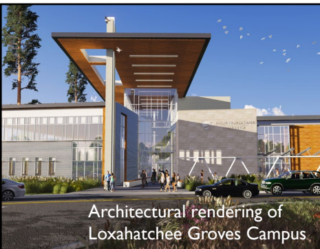
Architectural rendering of Loxahatchee Groves Campus

515 Mulberry Street, Suite 200 Macon, Georgia 31201 (478) 330-6222 | www.myersmcræ.com