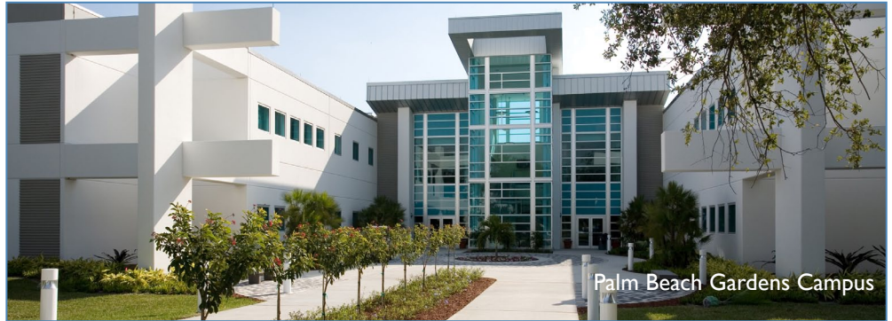
Palm Beach Gardens Campus

The county offers a multitude of attractions, entertainment, and shopping options. The area has some of the best restaurants in the country, with a vibrant nightlife.