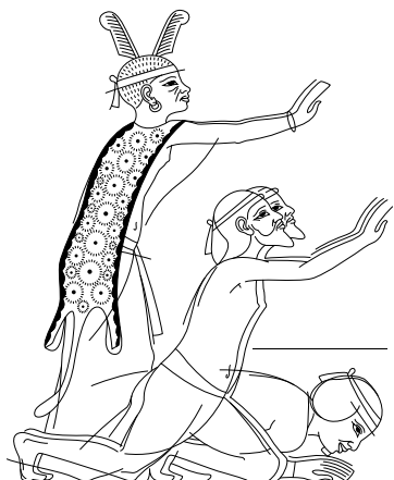
Figure 1.1. A second-millennium-BC Egyptian image of homage on limestone from the necropolis at Thebes (From Adolf Erman, Ägypten und ägyptisches Leben im Altertum , edited by H. Ranke [Tübingen: Mohr (Siebeck), 1923], 477, figure 188, attributed ultimately to Achille-Constant-Théodore-Émile Prisse D’Avennes, Histoire de l’art Égyptien d’après les monuments depuis les temps les plus reculés jusqu’à la domination romaine [Paris: A. Bertrand, 1878], Dessin #3.)

The prostration expressed by hištaḥwā and other similar words was not limited to the worship of the Deity. In the ancient world and many cultures today, lower-class individuals would customarily prostrate before social, economic, and political superiors. 41