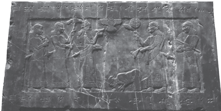
Figure 1.2. A first-millennium-BC Neo-Assyrian image of homage

envision a day when all kings and nations will prostrate themselves before YHWH. Indeed, poets even speak of heavenly creatures as worshipping before him (Pss. 29:1–2; 97:7). Note especially Nehemiah 9:6: