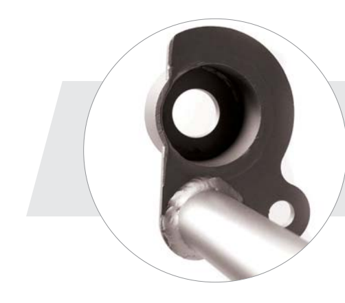
FULLY ENGAGED MOUNTS Built with precision-manufactured standoffs that fit directly into the frame, AltRider's stout crash bars protect like no other.