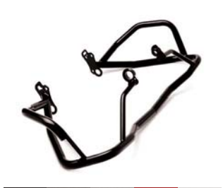
CRASH BARS Stainless construction means strength and rust-free bars