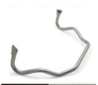
UPPER CRASH BARS

Whether you're riding for adventure or commuting to work, AltRider's goods keep your bike in tip-top shape. After all, crashes and accidents happen even in your own driveway. The AltRider crash bars are now stronger with the addition of the upper crash bars, increasing coverage and strength in the event of an impact. We sweat the small stuff too, with the new AltRider chain guard and rear brake master cylinder guard.