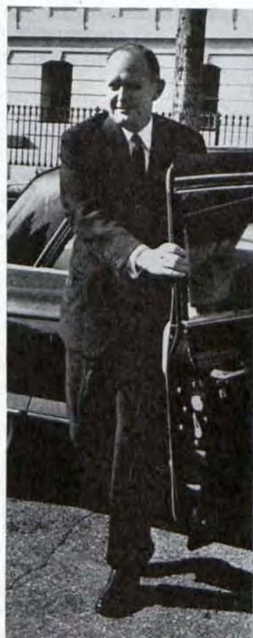
Treasury Secy. Douglas Dillon.