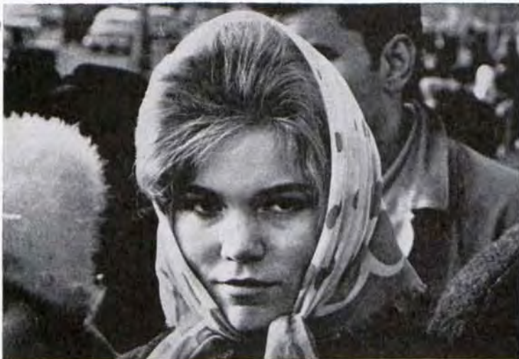
Office worker: "It's all the fault of that little bunch of American millionaires. You better get rid of them."