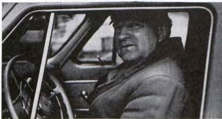
Cabbie: "War? I've been there. I am used to fighting."