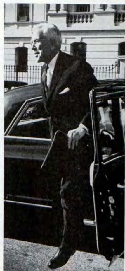
CIA Director John McCone.