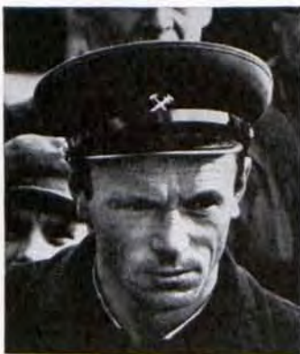
Laborer: "Tell me why you don't elect someone who doesn't always feel like going to war."