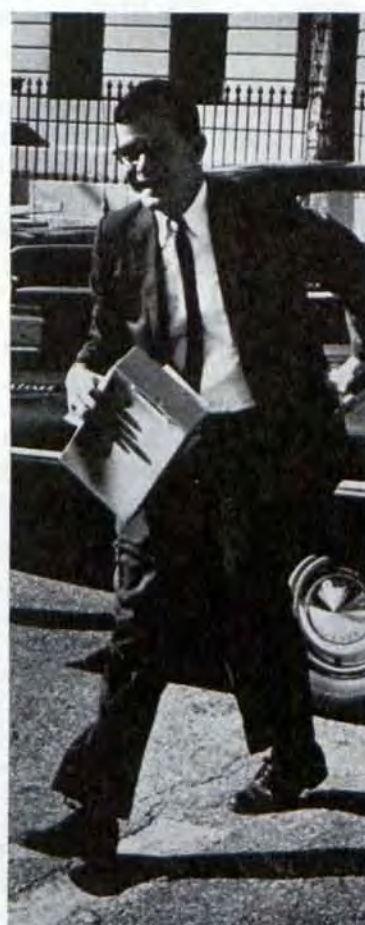
Special Counsel Ted Sorensen.