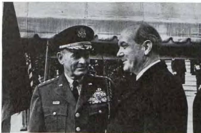
Gen. Maxwell Taylor and Secretary of State Dean Rusk.