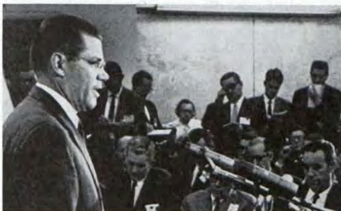
Secretary of Defense Robert McNamara.