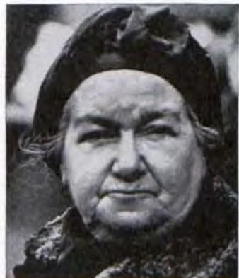
Grandmother: "These demonstrations are very stupid. What are all these children doing?"