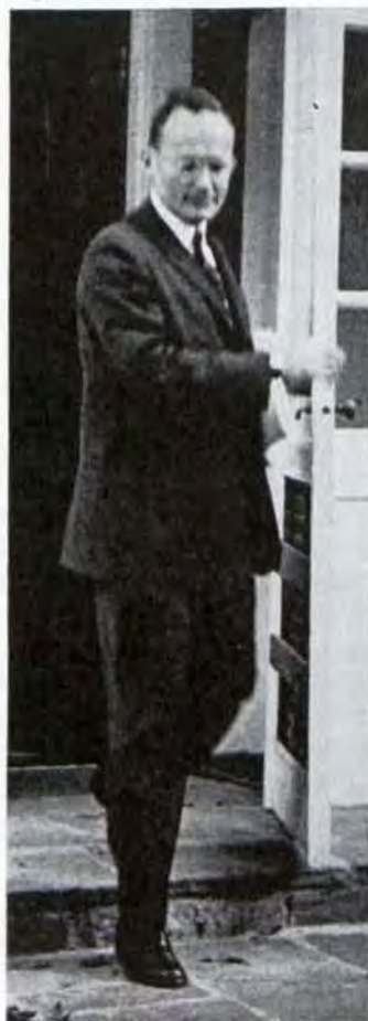
Special Aide McGeorge Bundy.