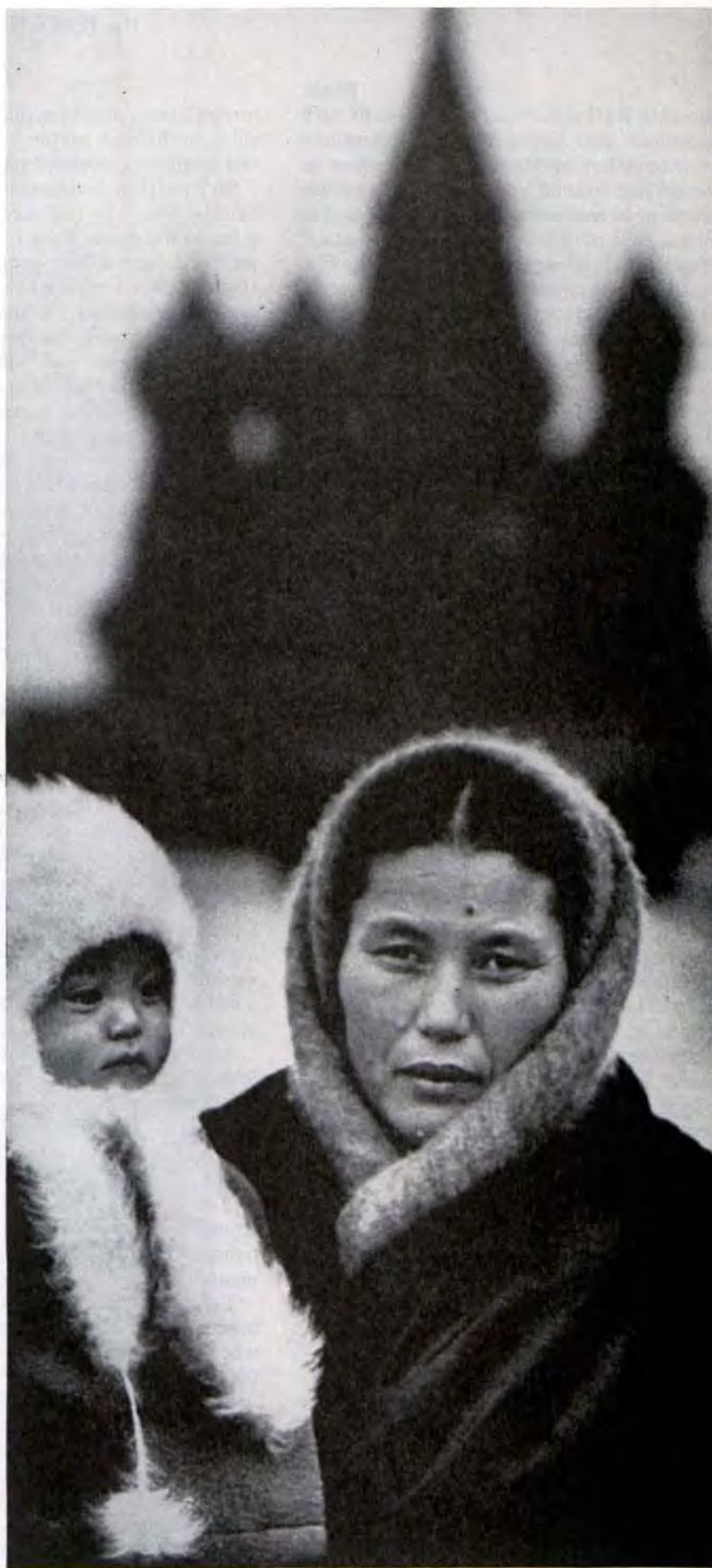
Siberian visitor in Red Square: "We work very hard on the land. We came to see Moscow. Here everyone talks about Cuba. We do not understand this. War is bad for people everywhere."