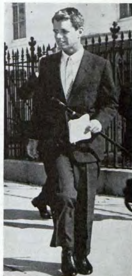
Attorney General Bob Kennedy played a major role in crisis.