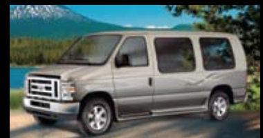
VAN CONVERSIONS/ CLASS B VAN CAMPERS