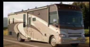
CLASS A MOTORHOMES