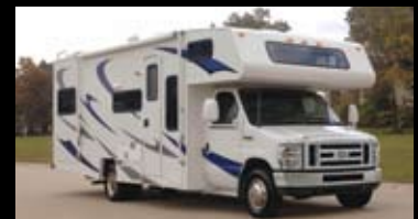
CLASS C MOTORHOMES