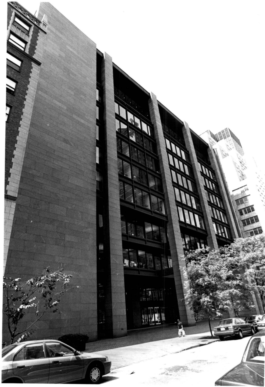
Ford Foundation Building, 321 East 42nd Street, Borough of Manhattan. View of East 43rd Street front.