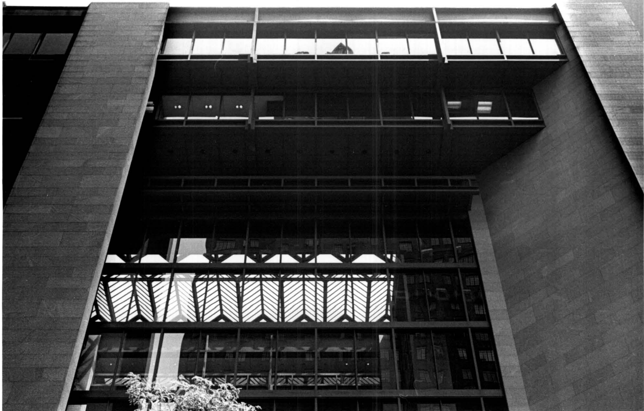
Ford Foundation Building, 321 East 42nd Street, Borough of Manhattan. Detail of upper floors.