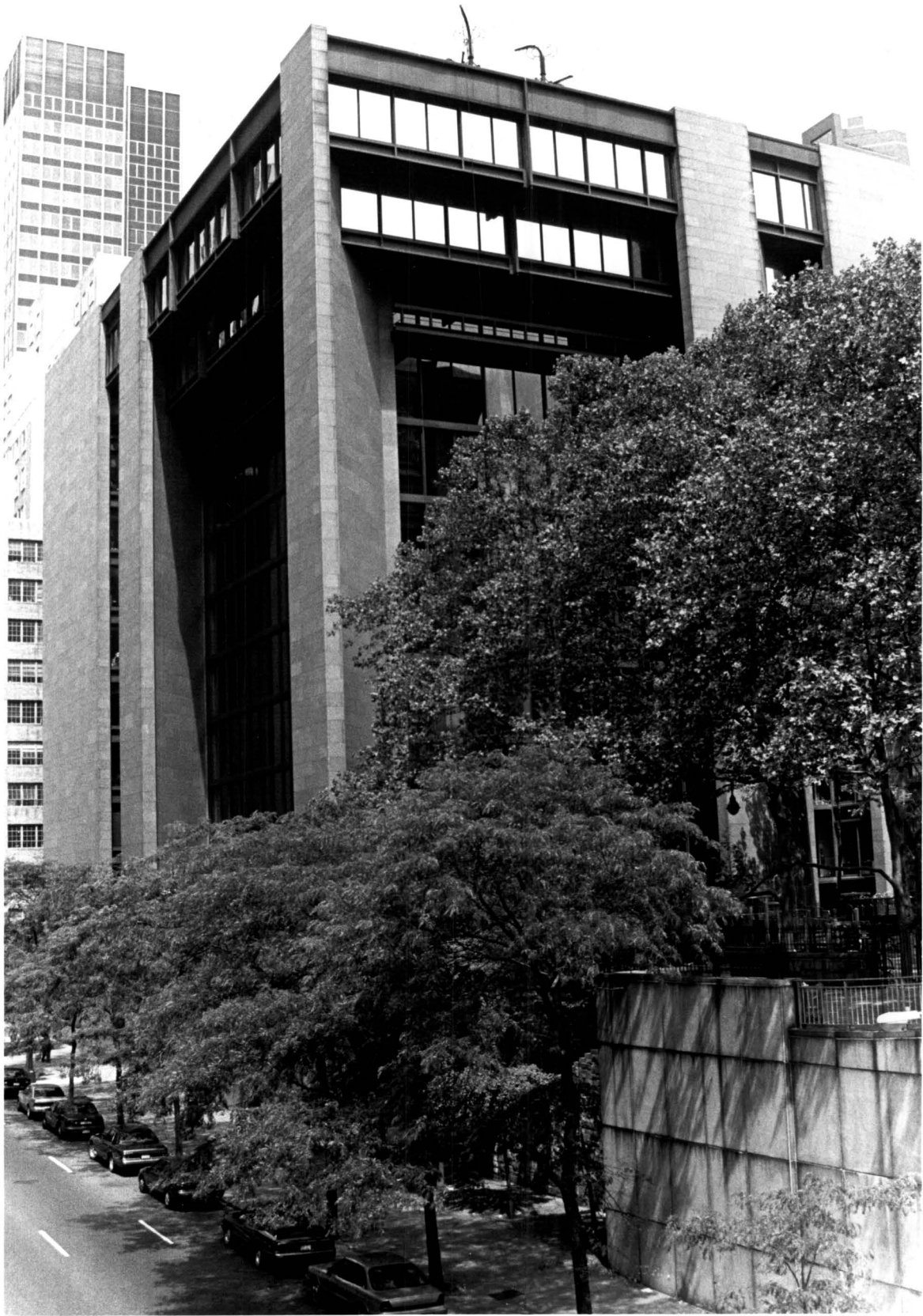
Ford Foundation Building, 321 East 42nd Street and 320 East 43rd Street, aka 309-325 East 42nd Street and 306-326 East 43rd Street, Borough of Manhattan.