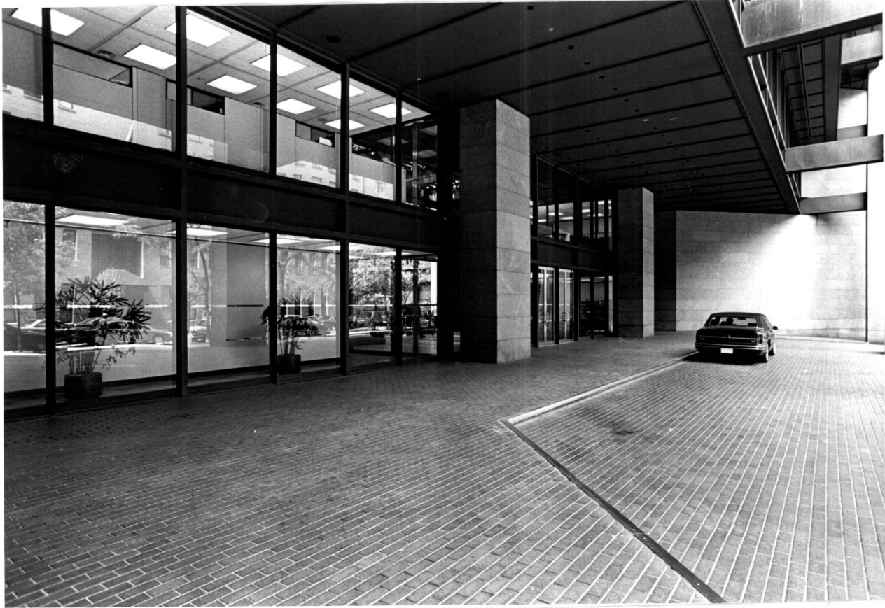
Ford Foundation Building, 321 East 42nd Street, Borough of Manhattan. View of East 43rd Street porte cochere