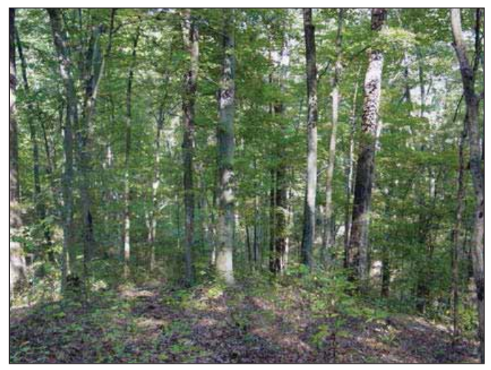
Figure 4. As trees grow older, the speed at which they occupy newly available growing space diminishes. Tree seedlings, shrubs and herbaceous plants capable of surviving or thriving in lower light conditions are able to occupy this new growing space.