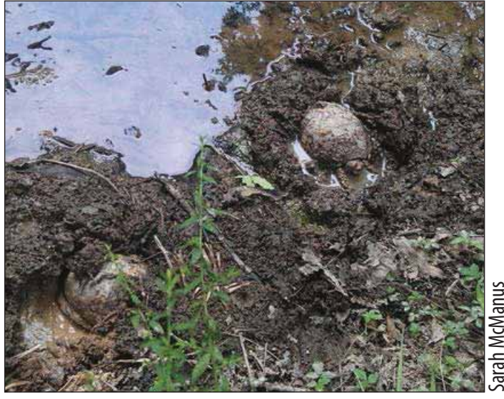
Figure 21. While primarily terrestrial, box turtles regularly seek out and use open water during periods of hot weather and drought.