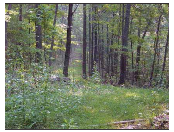
Figure 20. Skid trails and other forest roads can be constructed and maintained to reduce impacts to herpetofauna. Forestry Best Management Practices (BMPs) are a set of preventative measures that help control soil erosion resulting from timber harvesting.

timber rattlesnakes and box turtles. Furthermore, moving cull logs and other downed woody debris away from roadsides may reduce the use of roads by timber rattlesnakes.