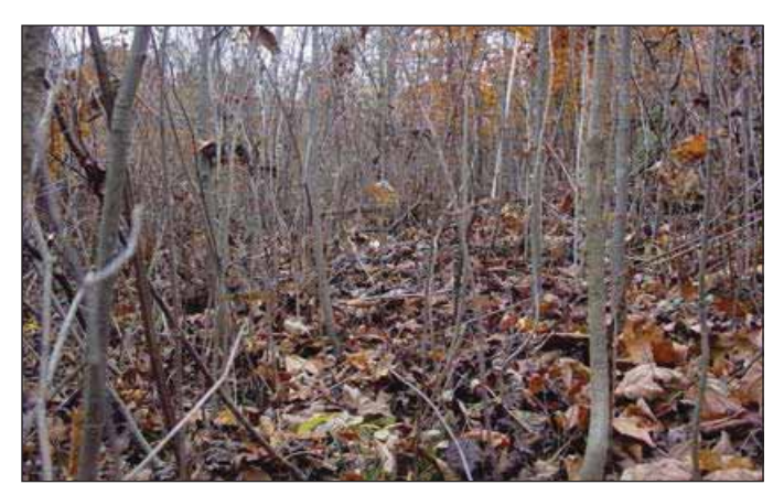
Figure 3. As trees grow taller, they occupy all growing space and either inhibit or exclude the establishment of other plants. The stem exclusion stage is characterized by a high density of young trees with a lower abundance of understory and ground vegetation.

space made available by the dying trees in their cohort (Figure 4). This allows new cohorts of slowergrowing, shade-tolerant vegetation to establish in the understory.