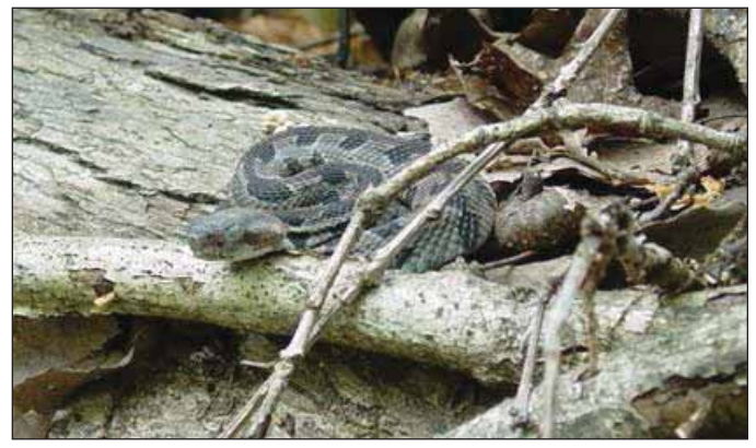
Figure 17. Downed woody debris (logs, tree tops, slash) should be retained in harvested sites. A neonate rattlesnake at birthing site is pictured above.