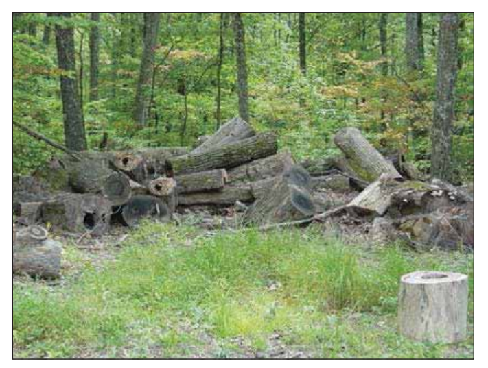
Figure 22. Logs with little to no market value for timber can provide cover and basking sites for reptiles.

• Human persecution and collection: Survival rates of timber rattlesnakes (unpublished data, B. MacGowan) and box turtles (Currylow et al. 2011) were relatively high on HEE sites. However, at least two rattlesnakes were intentionally killed by people and two were suspected to be collected or killed by people. Many states have restricted the collection of box turtles because of suspected population declines. Since persecution and/or illegal collection of reptiles and amphibians can exist in many forested areas, educational materials and policies to limit intentional killing (Reinert et al. 2011; MacGowan and Williams 2013) may help to alleviate this threat.