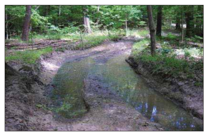
Figure 9. Pools of water in tire ruts are used by box turtles (thermoregulation) and some amphibians (breeding). However, their value is limited due to elevated drying rates and disturbance.

and may serve as refuges for displaced animals and sources for recolonization (Pough et al. 1987; deMaynadier and Hunter 1995; Ford et al. 2002; Greenberg 2001; Homyack and Haas 2009).