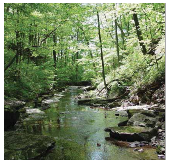
Figure 8. Harvest location might be adjusted to avoid or minimize disturbance to streams and other important habitat features.

and Andrews 2008), which may negatively affect species associated with litter depth (Moorman et al. 2011). For reptiles, gaps in the canopy may provide thermoregulatory advantages in the form of basking sites and woody debris for cover (Greenberg 2001; Renken et al. 2004; Currylow et al. 2012a). Canopy openings also could influence the temperature of overwintering sites, affecting burrowing depth (Currylow et al. 2012b). Though all harvest techniques result in the loss of at least some canopy cover, the amount removed and the distribution of that removal (size and shape of gap; gap vs. partial cut) are factors that can be adjusted to minimize negative effects to herpetofauna.