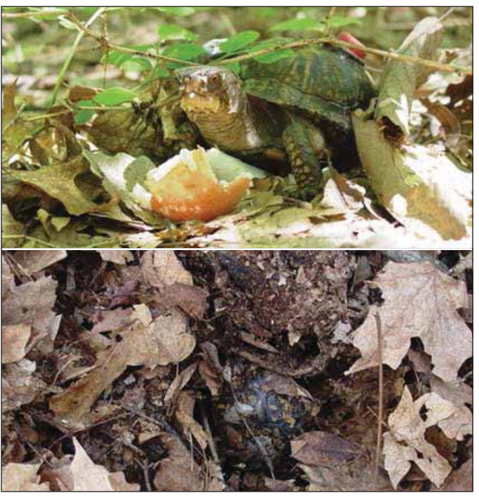
Figure 14. Temperature data loggers (red button on the shell) were used to study the thermal ecology of box turtles on the HEE (top). Box turtles overwinter in shallowly (10 cm) dug depressions. The amount of leaf litter and debris seems important. Depressions in old stump holes and old root tunnels are commonly used (bottom).

Hibernation depth of box turtles was estimated by comparing the body temperature of hibernating box turtles to soil temperatures at known depths (Figure 14). Box turtles hibernated at an average depth of 10 cm with a temperature of 3.28°C (Currylow et al. 2012b). All but one turtle hibernated within the forest matrix (i.e., not within harvest openings). Clearcuts were colder than forests and hibernation sites during hibernation but were the warmest areas during emergence. Within clearcuts, turtles must burrow to a depth of 20 cm to attain the average hibernation body temperature of 3.28°C (Currylow et al. 2012b).