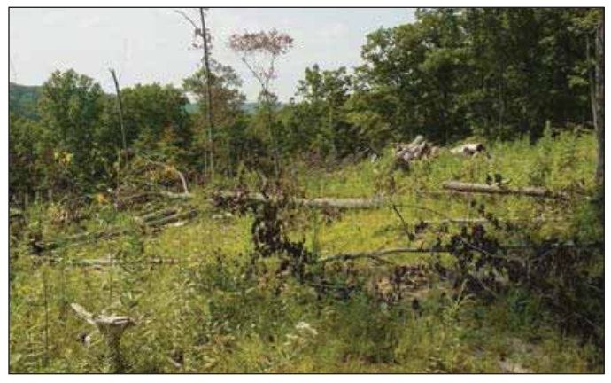
Figure 2. A wide range of herbaceous and woody plants grow together during the stand initiation stage of forest development. The environment changes rapidly as plants grow and new individuals occupy available growing space.

The second stage is stem exclusion, in which the established plants compete for light, water and soil nutrients (Figure 3). In this stage, some trees become dominant to the exclusion of others, which remain stunted or die. During this stage, the forest floor is heavily shaded and has a lower abundance of understory plants than other stages. As the successful trees continue to grow, the stand enters the third stage, understory reinitiation, in which the surviving trees grow older and do not fully utilize the new growing