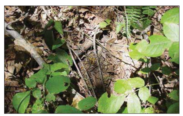
Figure 18. Box turtles dig shallow depressions under the leaf litter, called forms, to rest or cool off during periods of hot temperatures. Forms were commonly dug under downed tree tops and other woody debris.