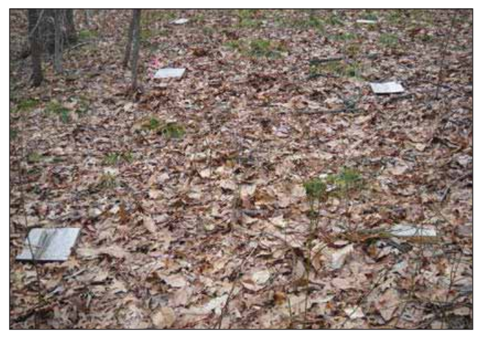
Figure 12. The use of artificial cover boards is a standardized method to assess the relative abundance of woodland amphibians. Grids of 30 coverboards were established throughout the HEE study sites. More than 21,000 salamanders were counted under cover boards during the study.

The response of salamanders to harvests was species-specific. The relative abundance of eastern redbacked salamanders ( Plethodon cinereus ) and northern slimy salamanders ( Plethodon glutinosus ) declined from pre- to post-harvest in patch cuts and clearcuts. Red-backed salamanders also declined in control sites, suggesting factors other than the harvests contributed to salamander declines over the study period. However, red-backed salamander declines observed in control sites were not as severe as those seen within patch cuts and clearcuts, indicating harvests were at least partially responsible for observed declines. The relative abundance of northern zigzag salamanders