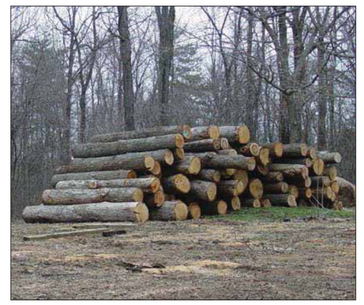
Figure 1. Forests provide a multitude of environmental (e.g., carbon sequestration, enhance water quality, wildlife habitat), economic (e.g., timber, wood products manufacturing, tourism) and social (e.g., recreation, aesthetics) benefits to society.

For much of human history, forest management has traditionally sought to maximize the output of goods and services (i.e., wood products and revenue). Consideration was given to biological processes only in the context of optimizing and sustaining timber production (Perry 1998). Within the field of forestry, it was widely believed that good timber management