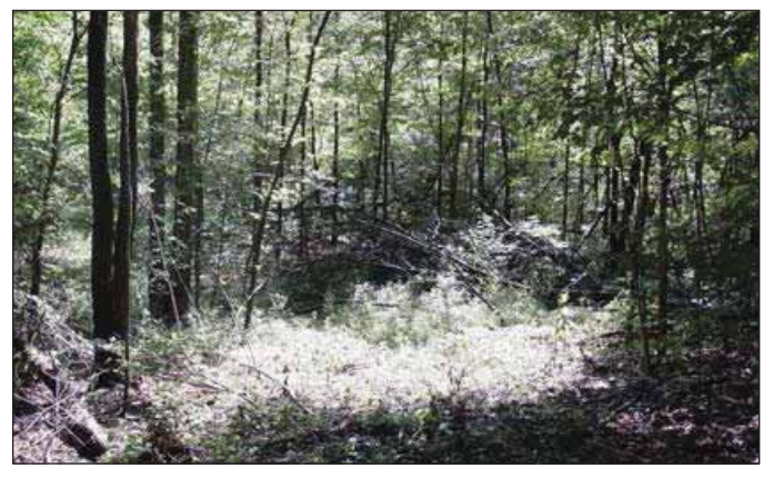
Figure 19. Single-tree (pictured) and group selection harvesting results in small canopy gaps.