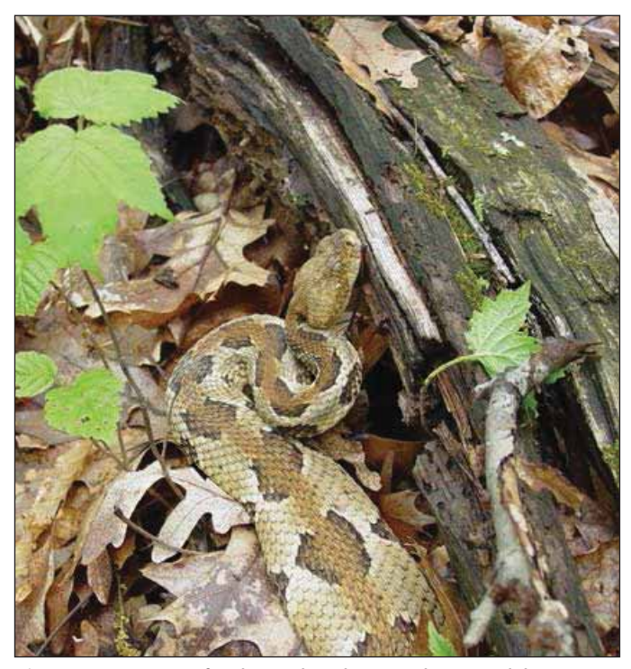
Figure 15. Locations of timber rattlesnakes were determined three times weekly using radio telemetry. Downed woody debris is an important structural component for feeding, reproduction and ecdysis.

rookeries (Brown et al. 1982; Walker 2000), making them potentially susceptible to timber harvesting at or near such sites.