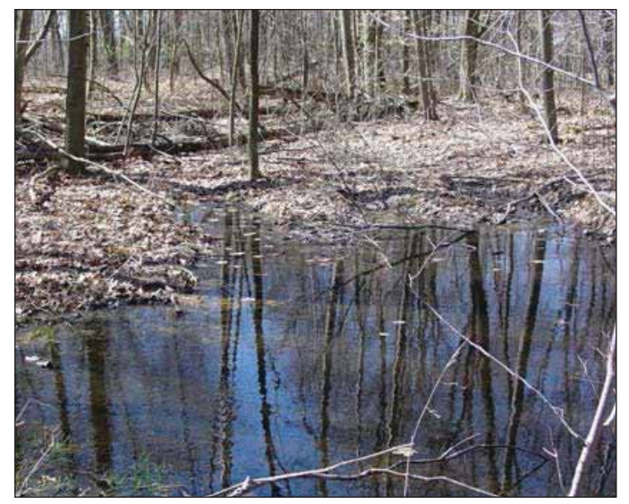
Figure 7. Many herpetofaunal species undergo annual periods of mass movement or increased activity, such as annual migrations to wetlands. Small vernal pools like the one pictured provide critical breeding habitat for many species of amphibians.

Timing : Many herpetofaunal species undergo annual periods of mass movement or increased activity, such as annual migrations to wetlands (Figure 7) or spring dispersal from hibernacula (overwintering dens). The timing of harvest activities may be adjusted to avoid such periods. Furthermore, movement within a season often is related to weather patterns; for instance, amphibian and turtle activity often is heightened following moderate to heavy rainfall. Extra vigilance paid by harvest personnel during such conditions could avoid incidental mortality from logging activities.