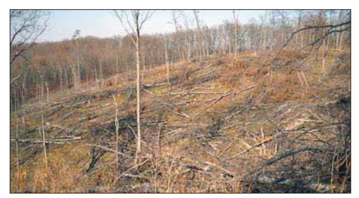
Figure 11. A 4-ha clearcut on a HEE management unit after one growing season. Trees left standing in the cut were removed during post-harvest timber stand improvement (TSI). Note the amount of downed trees and treetops. Picture was taken on Nov. 7, 2009.