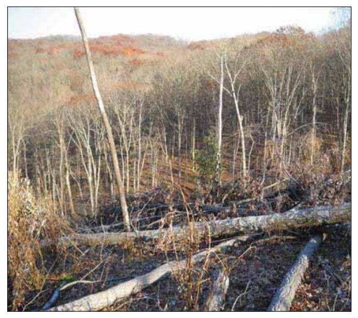
Figure 16. Clearcuts did not alter home-range size or movements of timber rattlesnakes. They frequently were observed within cut areas.

Timber rattlesnakes were monitored at control and even-aged HEE study sites for two years before harvest (2007-2008) and three years after harvest (2009-2011). Radio telemetry was used to track the locations of 47 individual snakes several times per week during the active season (April-October). Timber harvests had no effect on mean home-range size of male or female timber rattlesnakes. There was no evidence that snakes changed movement behaviors to avoid clearcuts. Indeed, several snakes were observed within clearcuts for several weeks and across multiple years (Figure 16). Females on even-aged management sites had greater home range shift after harvest than females in control sites, but sample sizes were too small to test statistically.