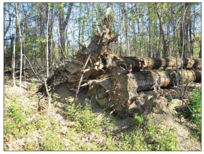
Figure 6. Root wads from fallen and uprooted trees can provide micro-environments favorable to some amphibians and reptiles.

Packham et al. 1992). Even so, the biological legacies left behind by some silvicultural practices can differ from those left behind by natural disturbance regimes (Franklin et al. 2007).