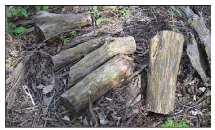
Figure 10. Woody debris remaining after timber harvesting can provide amphibians sanctuary from predators or desiccation.

In the following section, we summarize relevant biological information, study design and methodology, and the key findings for each target species studied. It should be noted that the behavioral responses of these target species reflect the scale of timber harvesting techniques within a largely forested matrix. It is unclear how these species would respond to larger and/or more numerous harvests.