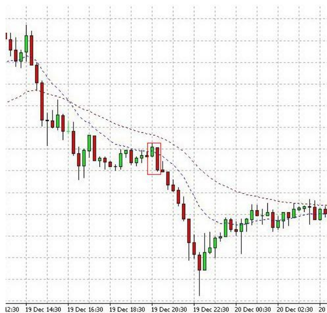
USDCHF M15 Chart

Blue line indicates our exit of this trade. The bearish candle went below our last stop-loss, so our position is automatically closed. We made in this trade 34 pips, and it took us about 4 hours. For a standard lot, that would be $340. Let's see another example.