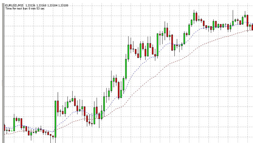
EURUSD M15 chart with 13EMA and 34EMA

Find the tutorials on their website, watch them and play a little with settings. Change the background, the colours of bars to those that you like. After getting accustomed to the platform, you'll have to install the indicators we are using for this strategy. My strategy is broken in 2 parts, for intraday traders and for long-term traders, you can try both and see which one fits your personality better. First one is for 15 min and 30 min time frames, the other one is for H4 and D1 time frames. For M15 and M30 we'll use two indicators, 13EMA and 34EMA, and for H4 and D1 we'll use other two, 10EMA and 21 EMA. How to install them: in your "Navigator" tab click on Indicators, choose Moving Average, in the new window choose method "Exponential", value 13, apply to "close", click "Ok". Then do this one more time, but with value 34. You can also choose the color of the indicator, its thickness and layout. On my chart below 13EMA is a blue dotted line, and 34EMA is a brown dotted line.