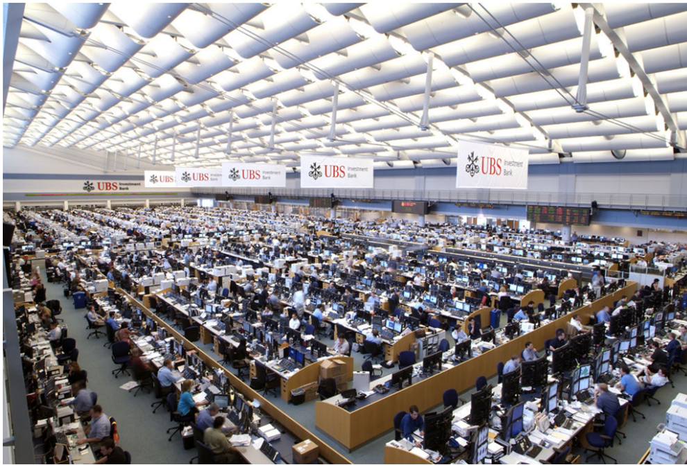
This is one of the biggest trading rooms in the world, in UBS Bank, Switzerland

Take a look at this pic. Many banks in Europe, Asia, United States have similar (but smaller) trading rooms where hundreds of traders perform trades for that bank on a daily basis. Do you think these banks would keep in their staff so many people if they could be easily replaced by some $77 robot? The answer should be obvious. Besides that, I don't know about you, but I like to keep control on my account, I like to know what's happening and what was the reason to take this or that decision. Hopefully you think the same.