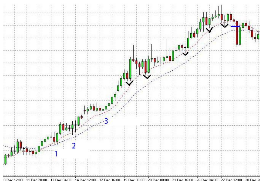
EURAUD H4 Chart

This trade brought us 79 pips. Let's see another one.