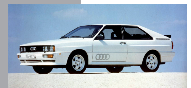
The Audi Ur-quattro: the pioneer with the first standard all-wheel drive in a sports coupe - and of course with Fuchs wheels.

The NSU Ro80 convinces with its aerodynamic body and its 'shapely legs' - the Fuchsfelge.