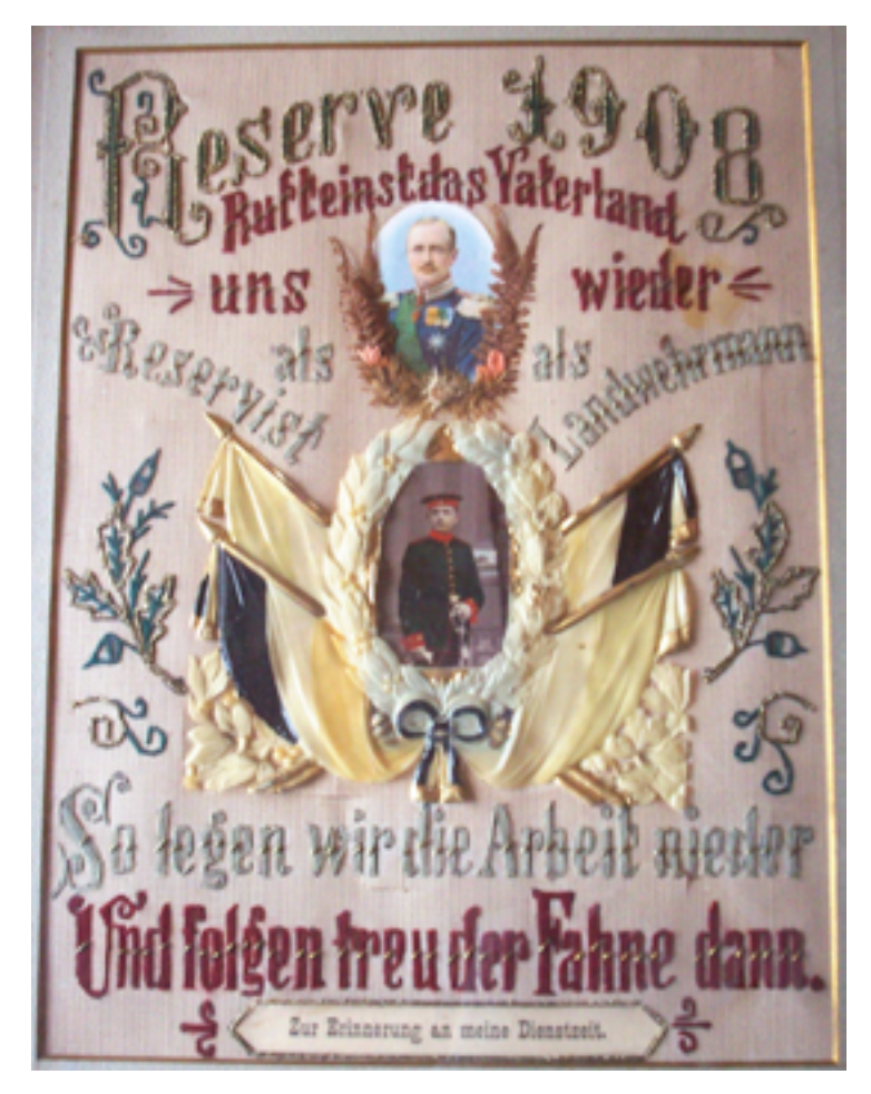
Figure 4 – Army Service Certificate 1908 55

The German public and public institutions held a high respect and admiration for the army, the 'architects of unification'.<sup>56</sup> Officers and soldiers enjoyed various privileges and were generally preferred for posts in the strictly hierarchical bureaucracy.<sup>57</sup> The uniform carried a lot of power - politicians and nobles were hardly seen without their uniforms and decorations and the public had a special affinity for uniforms as well. As a Turkish diplomat in Berlin remarked, 'Prussian ladies never tire of seeing soldiers'.<sup>58</sup> Just how successful wearing a uniform could be in instilling 'blind obedience' can be illustrated by an incident in 1906, where a mere unemployed artisan, Wilhelm Voigt, made a fool of the mayor of Köpenick (near Berlin). Dressing up in a stolen captain's uniform, Voigt ordered some soldiers to arrest the mayor. The 'Captain of Köpenick' made off with 5,000 Marks and became a folk hero.<sup>59</sup> This shows how far the indoctrination of military obedience, that was also propagated throughout officialdom, had reached, but also how the German public did see the humour in Voigt exploiting this 'blinden Gehorsam'.