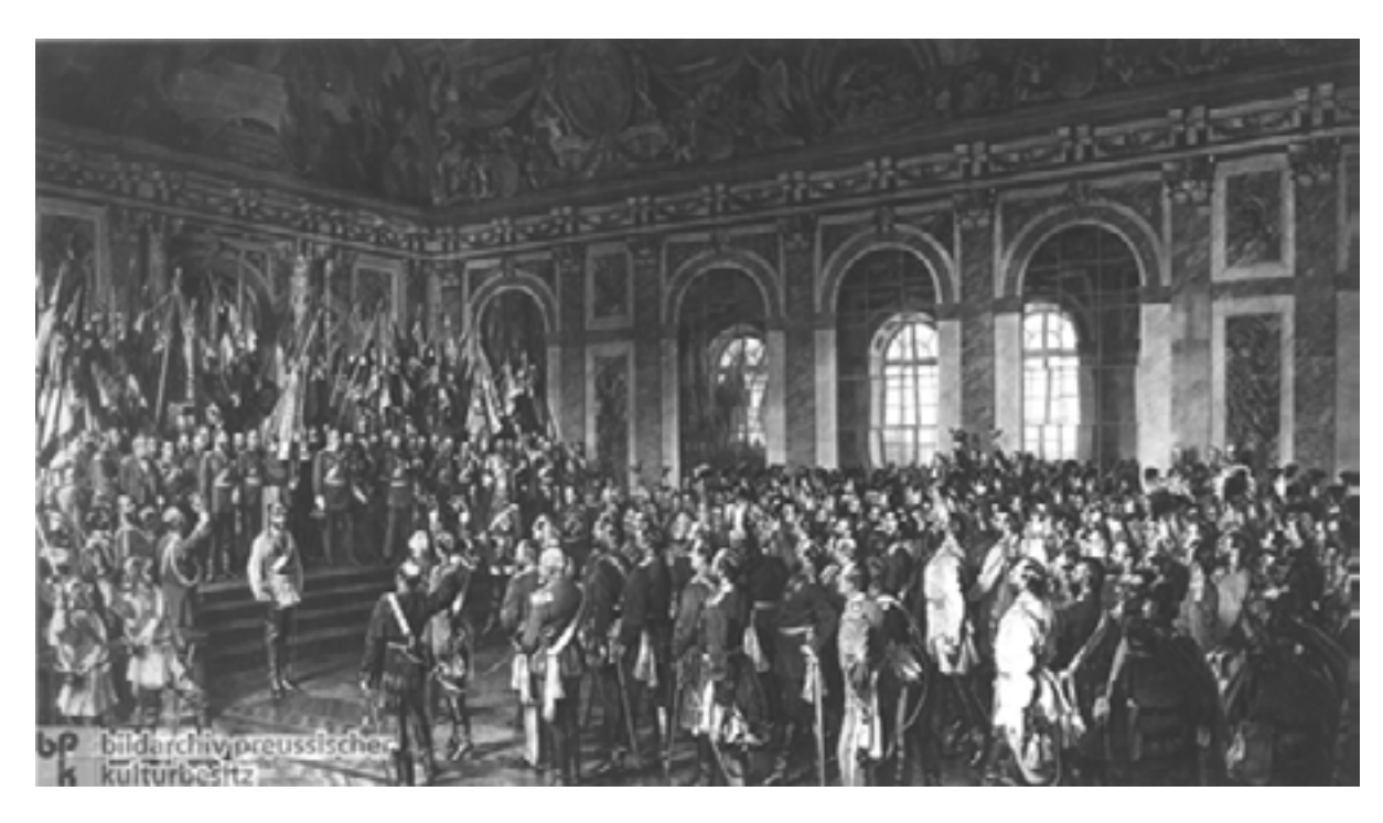
Figure 1 - Anton von Werner, The Proclamation of the German Empire (January 18, 1871).<sup>24</sup>

Erbfeind France. The military, including a respectable portion of non-Prussian contingents such as Saxon, Bavarian and Swabian troops, achieved a decisive victory at Sedan.<sup>23</sup> A few months later the German Empire was proclaimed as a federal union of the various states. The unification was not a public affair of the Volk , however, its military character is clearly shown in Figure 1 below: