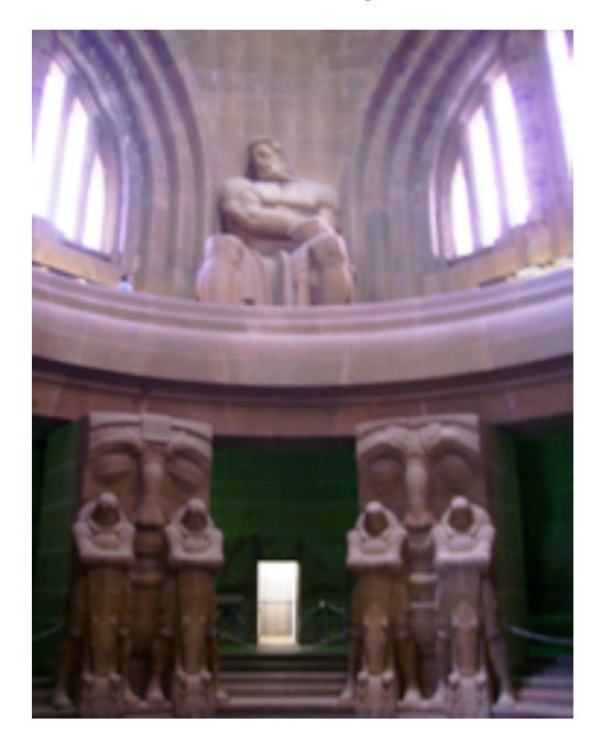
Figure 3a – Völkerschlachtdenkmal (interior)<sup>45</sup>

of introducing Hermann to the national German heritage in his play Herrmannsschlacht , which was ostensibly anti-French.<sup>42</sup> The colossal statue of Hermann is a bellicose hero, his sword inscribed with the words 'German unity is my strength; my strength is Germany's might'.<sup>43</sup> This strength is also encapsulated in the Monument to the Battle of Nations ( Völkerschlachtdenkmal ). It is the largest memorial in Germany and commemorates the 1813 battle and Napoleon's defeat. However, the monument does not portray the battle itself; rather it celebrates Germany's national military power and German sacrifice. The giant solemn warriors of the krypta inside the building describe what George Mosse called 'sacred spaces of a new civic religion' to the heroic dead (refer Figure 3a) - and in fact it is an imposing statue Archangel Michael that guards the entry to the memorial, bearing resemblance to a church (Figure 3b).<sup>44</sup>