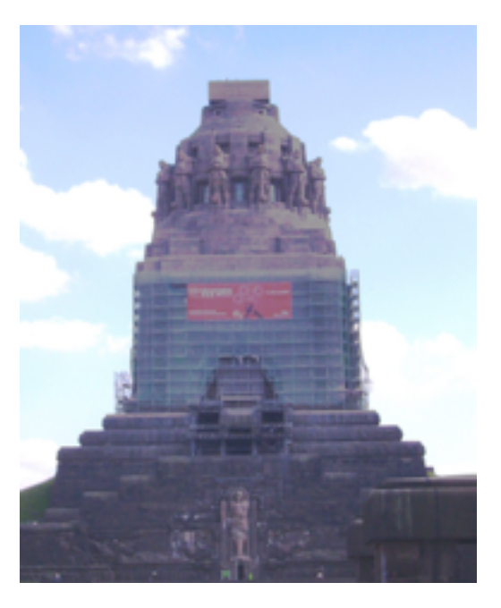
Figure 3b - Völkerschlachtdenkmal (exterior)<sup>46</sup>

49 Schmidt quoted in Baeumer, 'Imperial Germany as Reflected in Its Mass Festivals', 67 50 German History Docs, "Monument to the Battle of Nations (1897-1913)", n.d.,http://www.germanhistorydocs.ghi-dc.org/