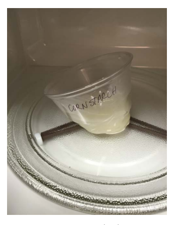
We recommended you use heat-resistant, disposable cups, NOT standard plastic cups for this activity, as they tend to melt in the microwave.

Drying – While you can dry the molds in the open air, drying the molds in a controlled temperature environment is faster and gives more repeatable results. Good drying methods are to set an oven at 150° F or use a food dehydrator.