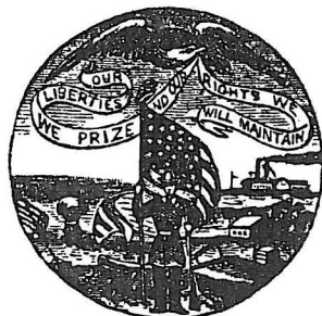
SEAL OF THE STATE OF IOWA

THE CENTURY HISTORY COMPANY 41 LAFAYETTE PLACE NEW YORK CITY