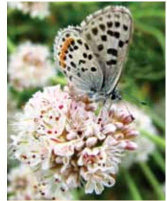
Smith's blue butterfly

Pelicans, grebes, Caspian terns and gulls fly over the sea, hoping to find such prey as surf perch, rockfish, squid and night smelt. Step carefully to avoid the nest of the western snowy plover, a small, threatened bird that blends into the beach sand.