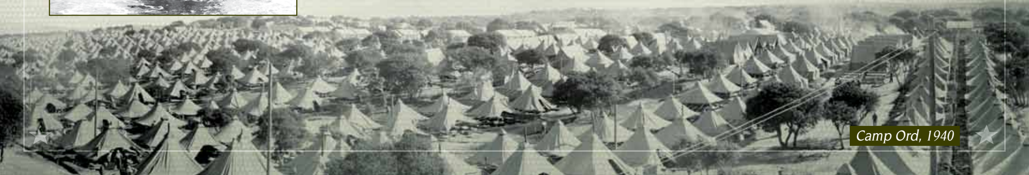
Camp Ord, 1940 ★