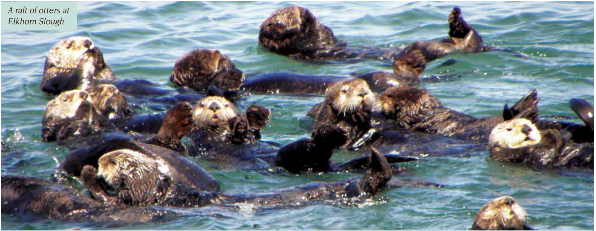
A raft of otters at Elkhorn Slough