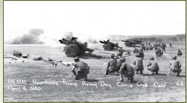
155 M.M. Howitzers Firing Army Day Camp Ord, Calif 66 April 6, 1940.

To preserve the fort's sensitive natural habitats as well as its scenic and cultural values, about 14,500 acres of the former military reservation became Fort Ord National Monument in 2012. Eighty-six miles of its multi-use trails may be explored.