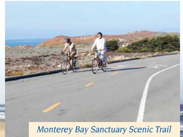
Monterey Bay Sanctuary Scenic Trail

Salinas River Mouth Natural Preserve and Salinas River Dunes Natural Preserve form a portion of this park. A mile of dune trail begins in two of the three parking lots, and it links two coastal access points.