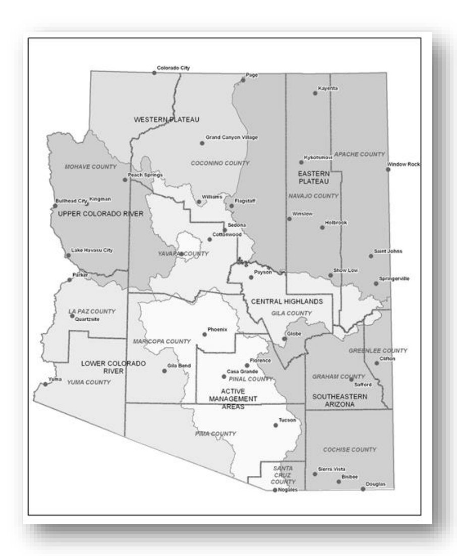
Figure 3 – Arizona Planning Areas (ADWR, 2009) including the Central Highlands Planning area (region of comparison for this evaluation)

In general, the region of comparison is the Central Highlands Planning Area (CHPA), one of seven planning areas identified by the Arizona Department of Water Resources in Arizona (Figure 2). It encompasses about 13,900 square miles (36000 km2) and includes the Agua Fria, Salt River, Tonto Creek, Upper Hassayampa, and Verde River Basins. Most of the Fossil Creek WSR corridor lies within the Central Highlands Physiographic Province, which is a transition zone between the Basin and Range lowlands to the south and west and the Plateau Uplands to the north and east.