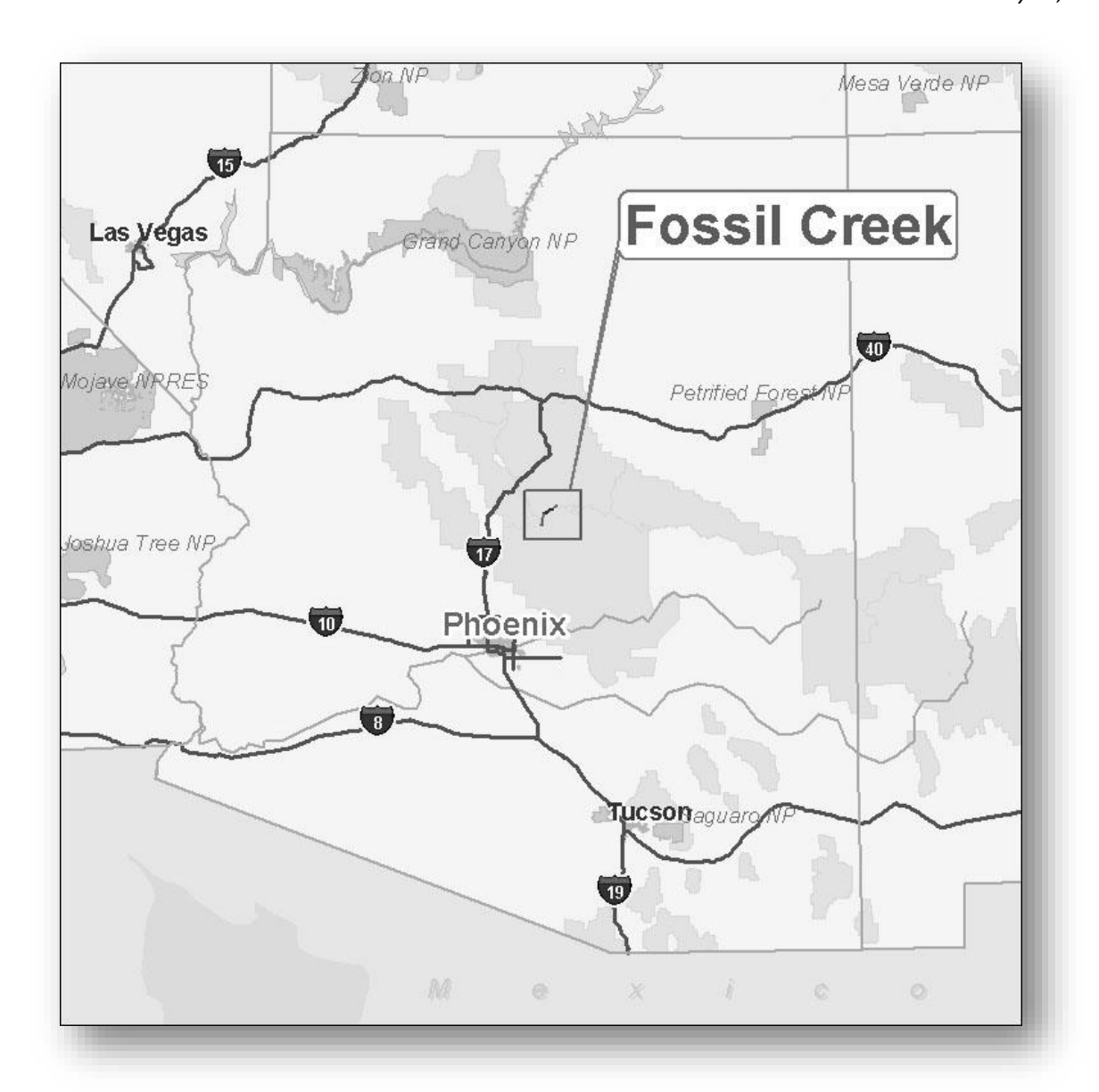
Figure 1 - Arizona map with Fossil Creek location