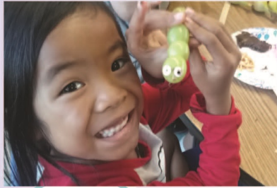
Hungry Caterpillars Meet Hungry Children.