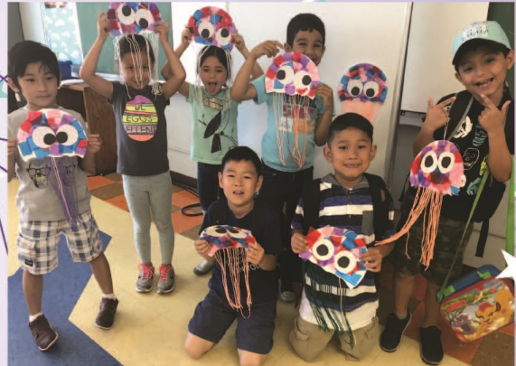
A School, or Bloom, of Jellies.