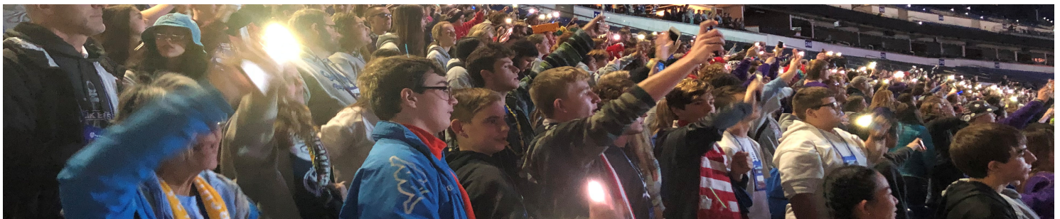
OLL students at NCYC 2019