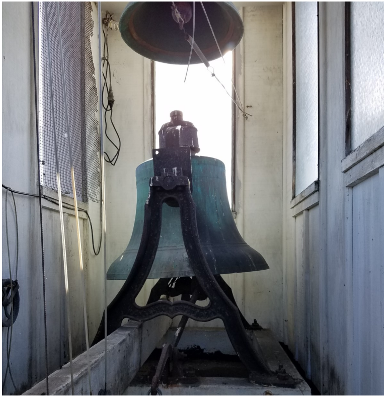
The Christ Church Bells Ready to Ring