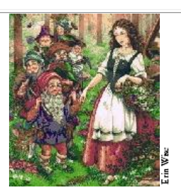
Snow White and the Seven Dwarfs