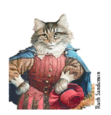
Puss in Boots