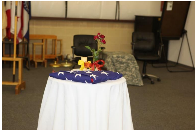
Fallen/Missing In Action Table

Upon completion of the punch bowl ceremony, “Toasts” were presented and the meal was served. Following a brief intermission, the guests were treated to MG(R) Singlaubs presentation. Upon completion of MG Singlaubs remarks, the evening concluded with the retirement of the ‘Colors!’”