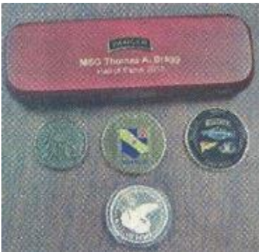
A collection of tokens and pens made from bullet casings commemorating his service to country and induction into the Ranger Hall of Fame