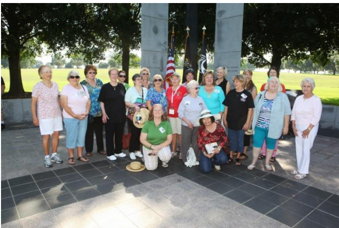
Lady Rangers in Attendance