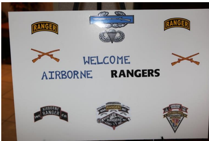
Welcome sign upon entering

It was an event filled week as old friendships were renewed and new friendships were forged.