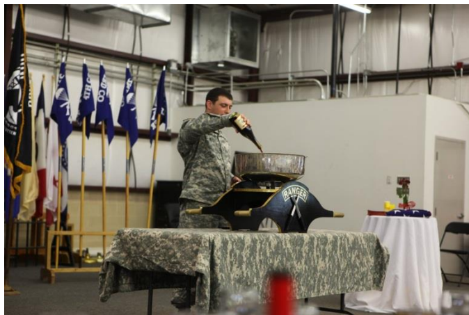
Preparing the Ranger Punch