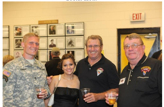
Rangers “Past” and “Present”