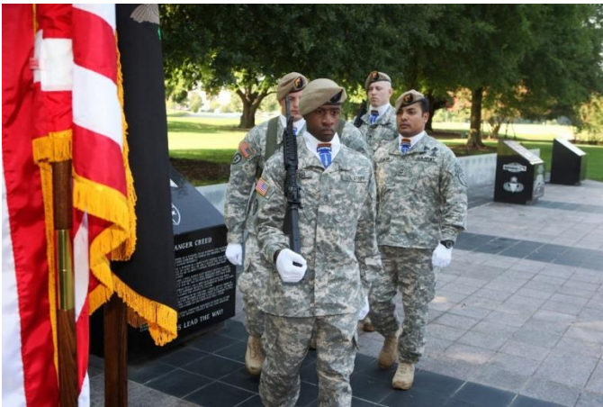
Retiring the Colors