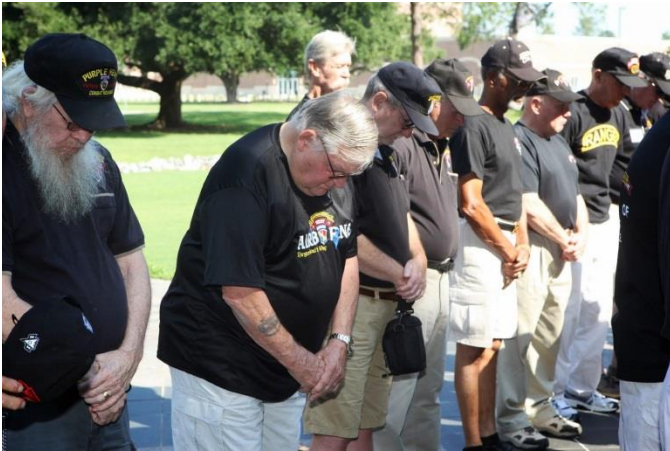
Remembering the Fallen