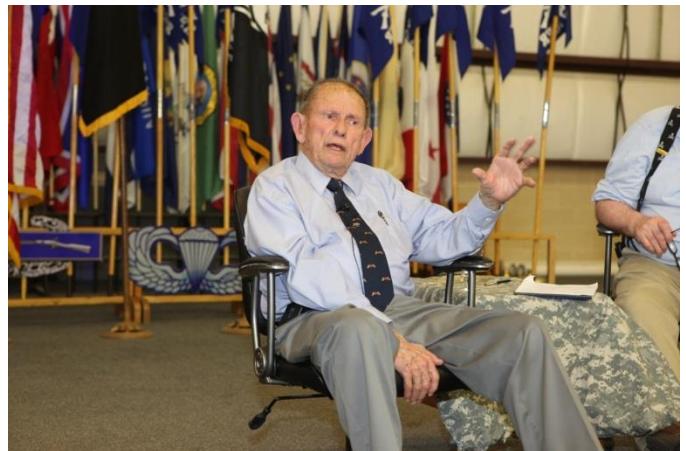
MG(R) Singlaub addresses the audience

Following the “Fallen/Missing in Action Ceremony the “Ranger” Punch was prepared. Six members of the 75 th Ranger Regiment volunteered for this mission, fully knowing the hazards of their chosen profession.