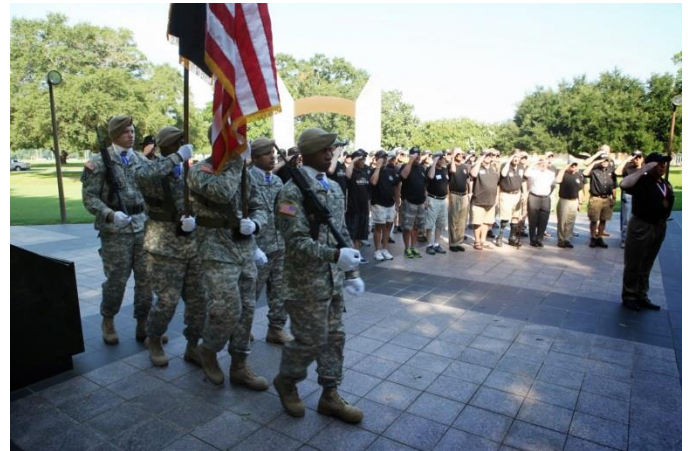
Posting the Colors

Friday morning, Echo 20th Infantry LRP/Charlie Ranger gathered at the Ranger Memorial to honor their fallen comrades.