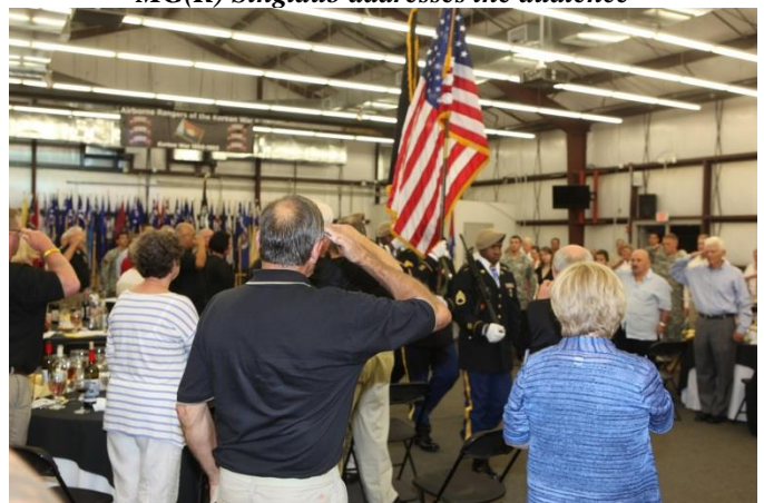
Retiring the ‘Colors’