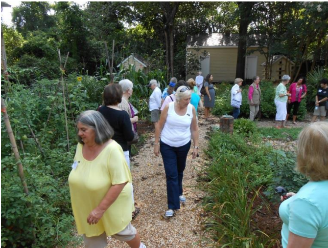
Lady Rangers Tour Historic Midtown Columbus

Concurrently during the change of command, the lady Rangers enjoyed a bus tour of historic midtown Columbus and the Springer Opera House.