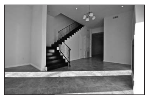
715 N KILKEA DR OPEN HOUSE 2/19/2012 - 2:00PM-5:00PM - ***LUNCH SERVED***