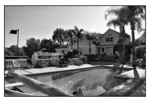
DAPPLEGRAY LANE Shown By Appointment