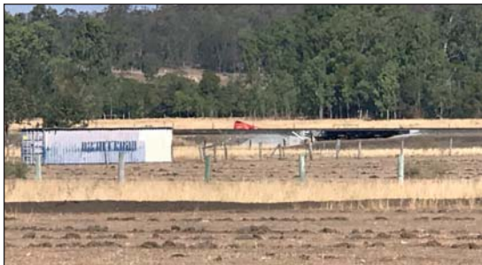
Rail bridge on Rosewood-Laidley Road Grandchester.

The $28 million project to replace the ageing timber rail bridges between Rosewood and Chinchilla is expected to wrap up by the end of October.