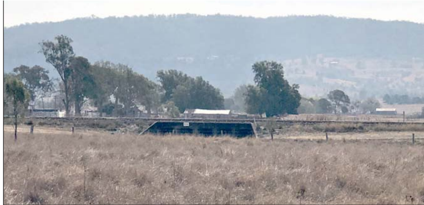
Rail bridge on Old Grandchester Road at Lanefield.