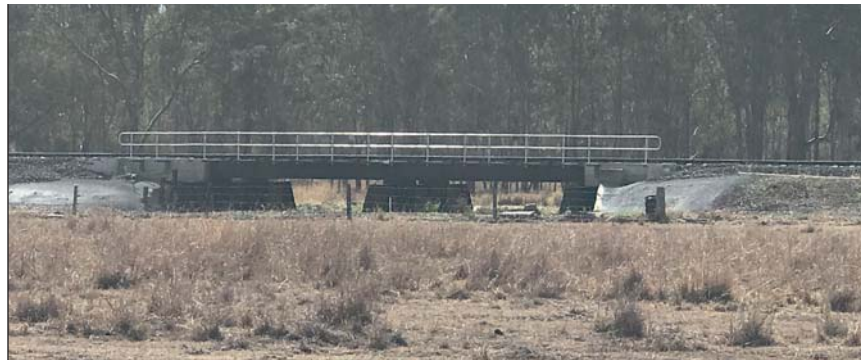
Rail bridge on Waters Road at Lanefield.