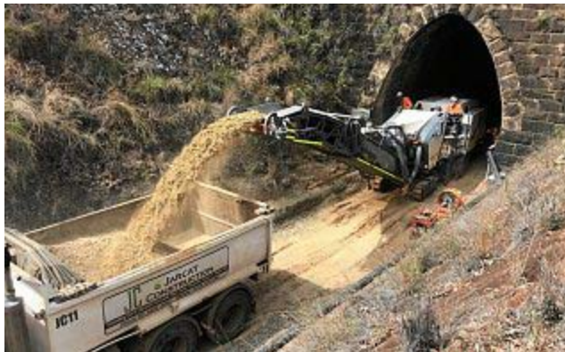
READY TO ROLL: Workers dredging gravel and sand to lower and widen an old train tunnel along the range to make them large enough to handle modern contain freight.

Existing tracks along the tunnels have been replaced with pre-cast concrete slabs, which require less maintenance. The Toowoomba range is a geographically challenging section of the state rail network, with the upgrades designed to make the range more resilient to wet weather and unplanned disruptions.