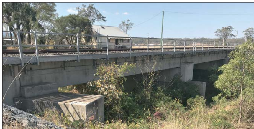
Rail bridge on Hiddenvale Road Calvert.