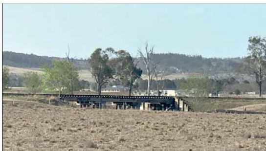
Rail bridge outside Rosewood.