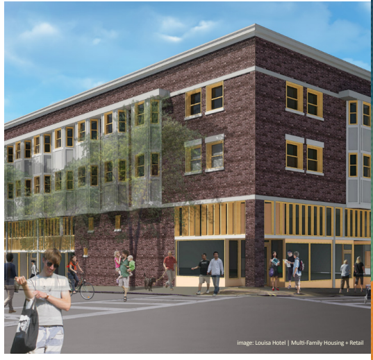
Thank you SCIDpda for your role in preserving, promoting, and developing Seattle's CID!

working in partnership for equity + social justice!