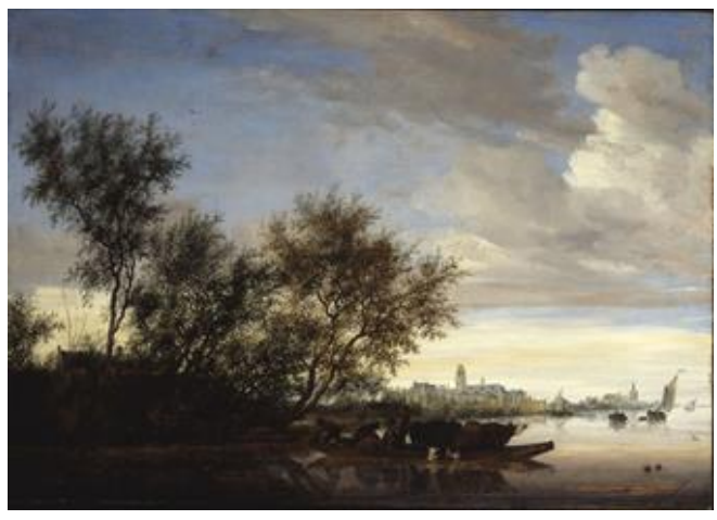
Salomon van Ruysdael (1600/03-1670), Ferryboat with Cattle on the Vecht River near Nyenrode, 1649, Collection W. Baron van Dedem

WvD: I always bought pictures that were close to my heart. Plusthe condition of a painting is everything. As a private collector, you can be choosy, and if you make a mistake, you can try to remedy it quite quickly.