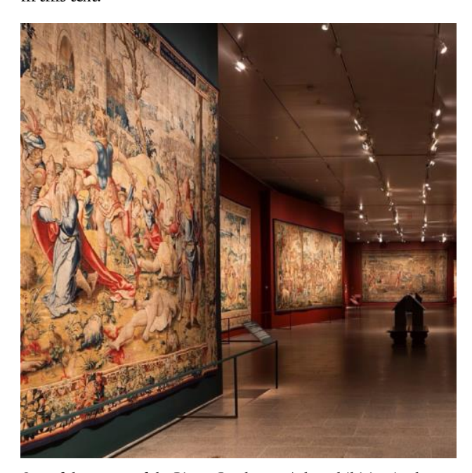
One of the rooms of the Pieter Coecke van Aelst exhibition in the Metropolitan Museum of Art, New York

This event was made possible by the help and personal commitment of all the curators and other individuals mentioned in this text.